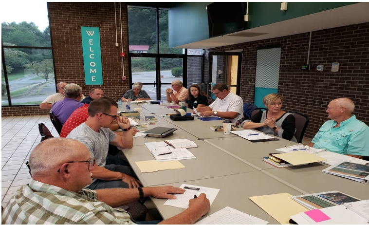
(Pictured Below: AST Class at Uplift Church in Weber City)