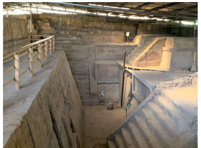
Right: Excavated buildings underneath grassy mounds like the one pictured above.