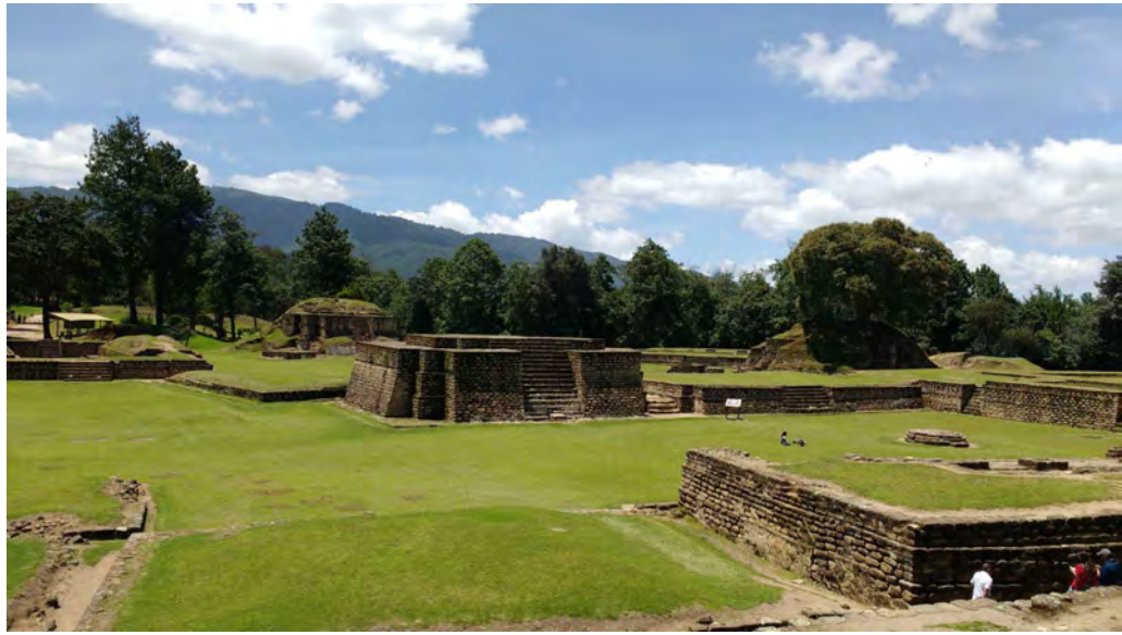
Below: Iximche, a later ruin, but a great setting for stories from