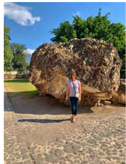
Right: Massive roof block from the earthquake-destroyed La Recoleccion convent.