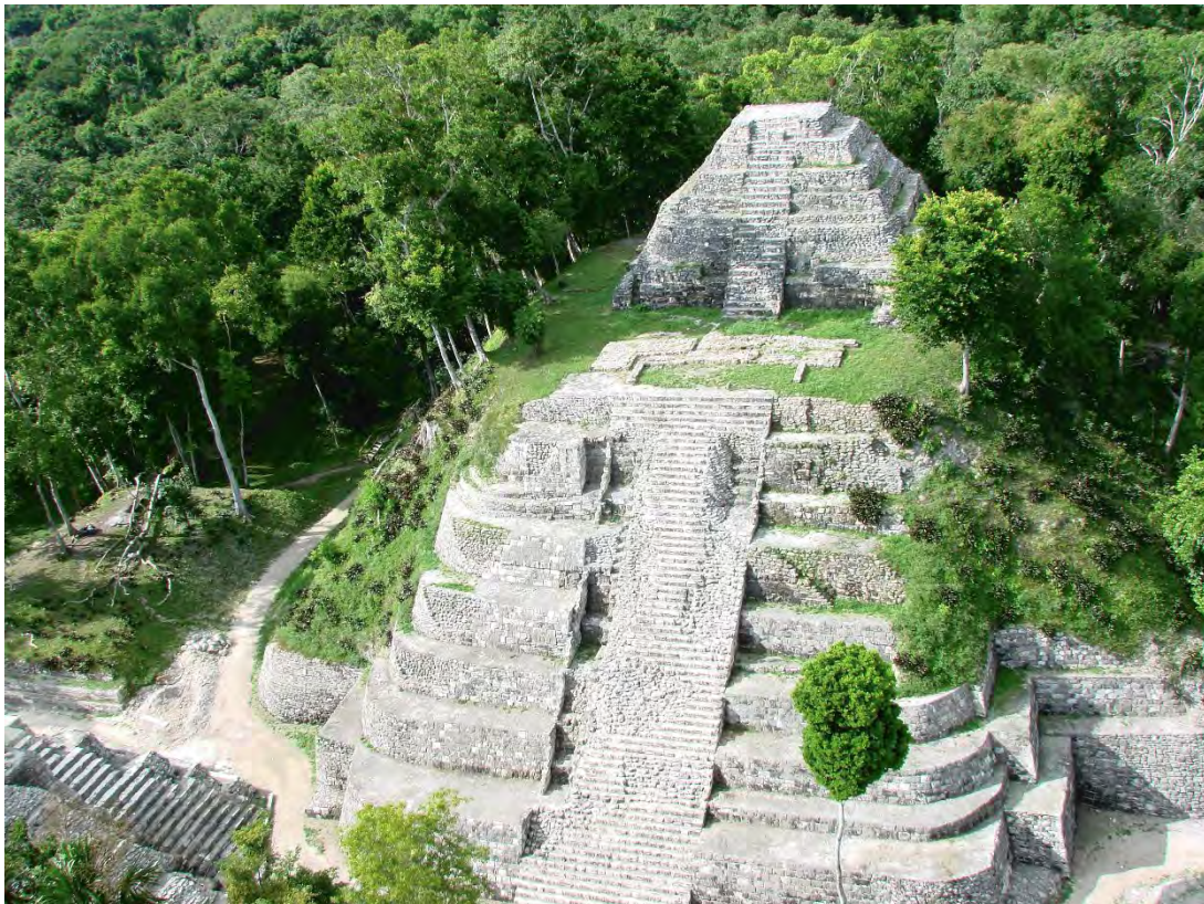
Above: Ancient Temple at Yaxha, one of the three “rooms of creation”