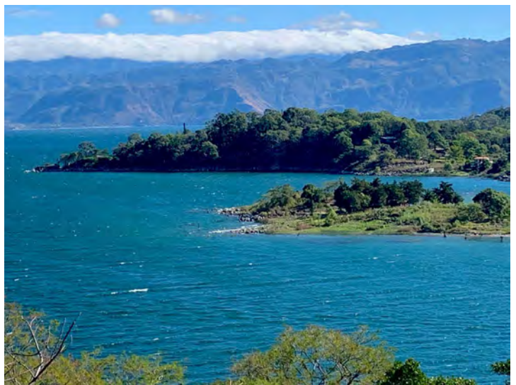
Above Left: The men of Santiago Atitlan. Above Right: Sunken city off the point.