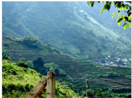
Lake Atitlan and its' Terraced Slopes