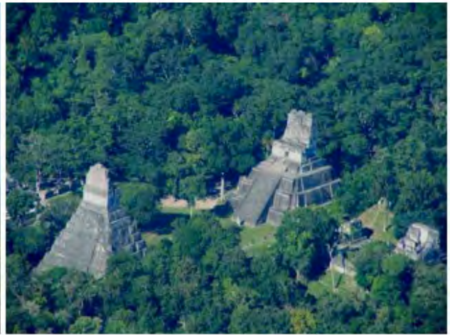
Arial of Temples 1 & 2