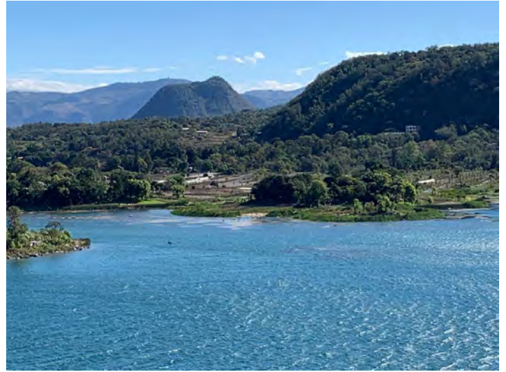
Stunning Lake Atitlan volcanoes.