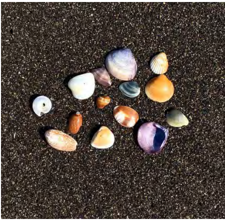
Above: Take a stroll on the rich, dark, volcanic sand beach at Monterrico.