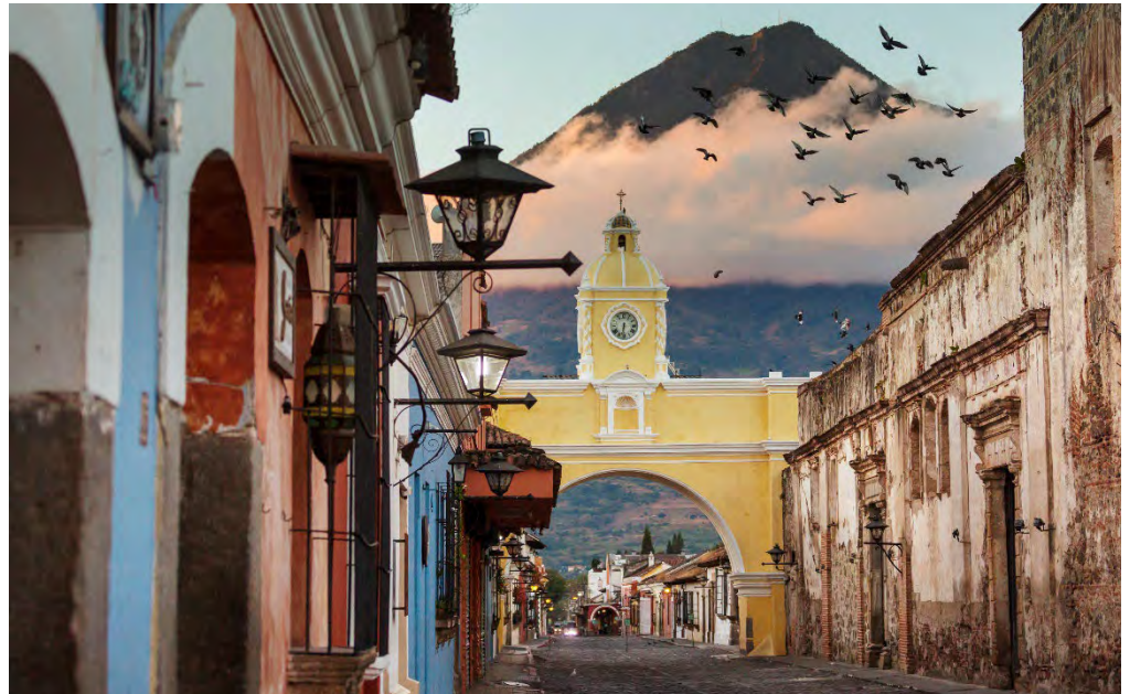
Above Left: View of Agua Volcano from our hotel entrance.