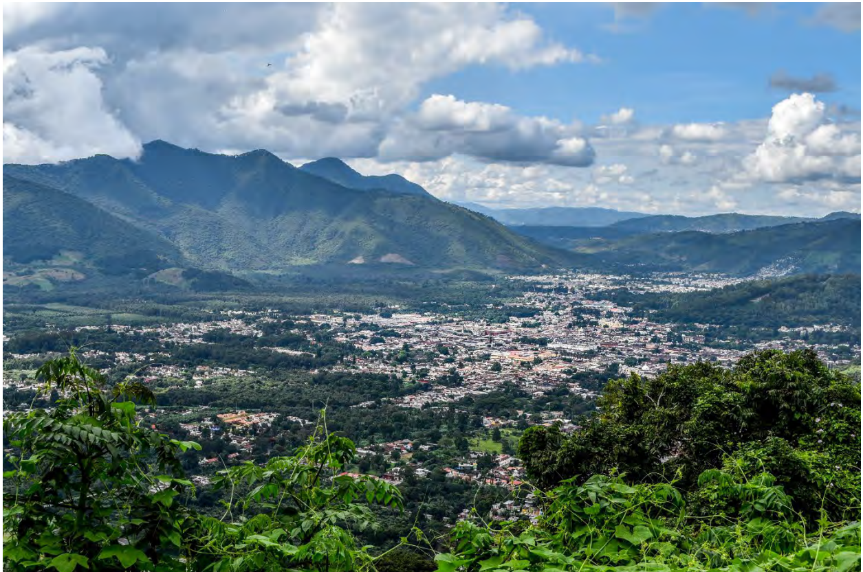
The Antigua Valley, nestled up in the mountains between 2 volcanoes, not far from the Pacific Coast