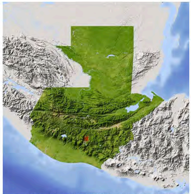
Guatemala, showing its Mountainous Southern Region and Jungled North