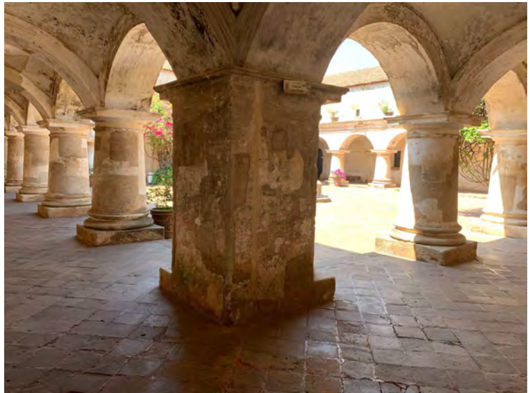
Above Left: The Antigua Guatemala Cathedral (in ruins). Above Right: Las Capuchinas Convent