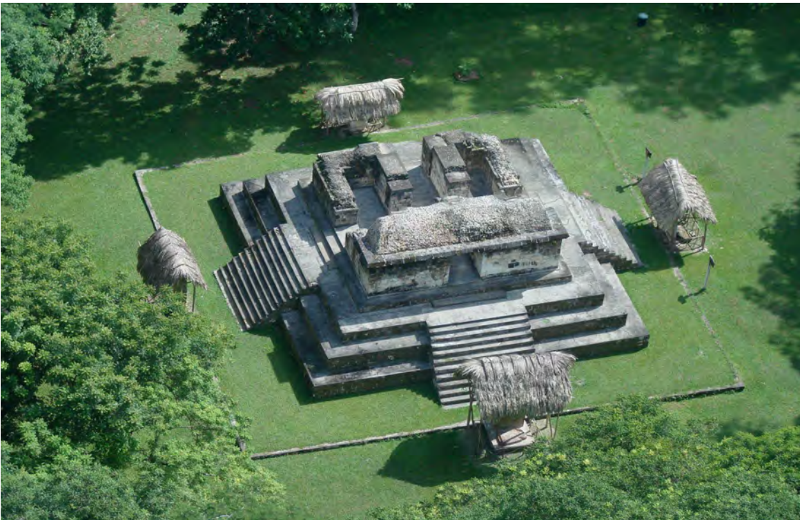
Ceibal, river capital in a bountiful, prosperous region.