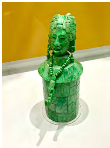
Left: Jade treasures from Tikal