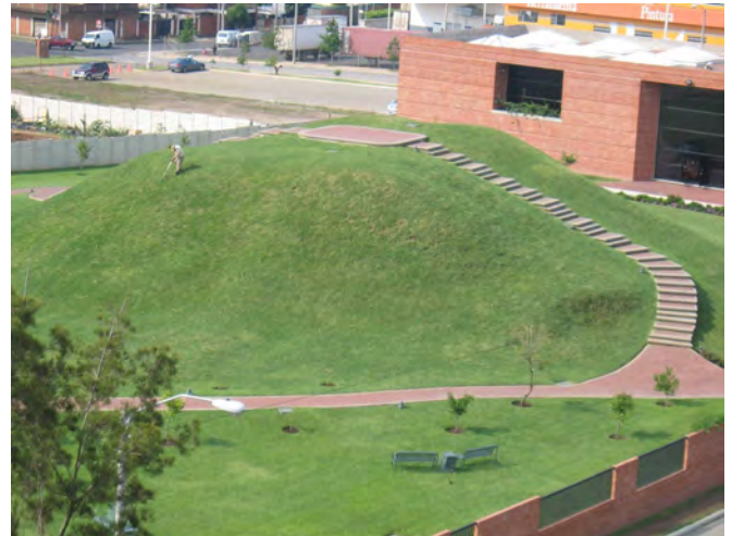
Above right: Pyramid mound at Kaminaljuyu, surrounded by Guatemala City.