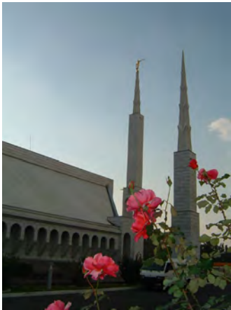
Left: Guatemala City LDS Temple

Tuesday, July 30, 2024 This tour is designed as best as possible to follow the chronology of the Book of Mormon, with stories from Lehi's Land of the First Inheritance, progressing through the Land of Nephi, Land of Zarahemla, and Land Bountiful. Our stop in the morning is at the Guatemala City LDS Temple. In the afternoon we head to the Pacific Coast, the west coastline of the Americas, and the black sand beaches at Monterrico. We know from Book of Mormon descriptions, that Lehi's first landing place was west of the Land of Nephi, therefore a west-coast landing (granted, the Pacific Coast of the Americas is a very long coastline!). Enjoy a stroll on the rich, dark, volcanic sand beach. In the evening we head to Antigua, the old colonial capital of Central America, just up a mountain pass from the coast. We stay at the 5-star colonial style Camino Real Antigua for the next 2 nights (breakfast, lunch, and dinner included).