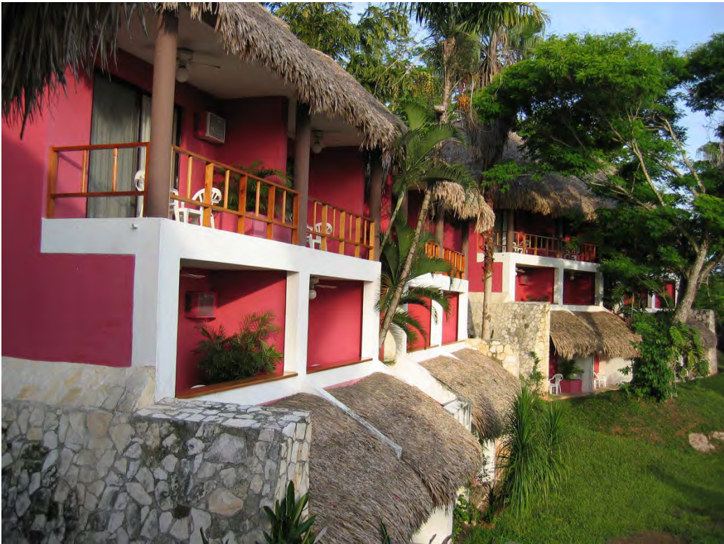
The Camino Real Tikal Hotel & Bungalows.