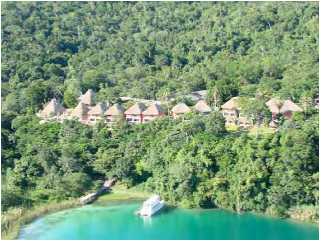
The Camino Real Tikal Hotel, nestled on the shores of Lake Peten Itza