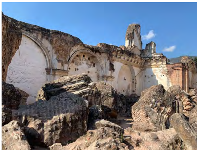
Left: La Recoleccion Convent, destroyed in the earthquake of 1774.