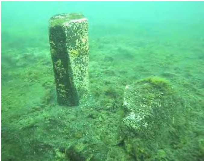
Left: Stela and altar from a sunken city in Lake Atitlan