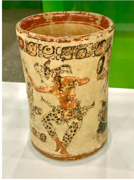
Far Left: Ceramic pot from Rio Azul with a “hot” chocolate drink recipe, described in glyphs.