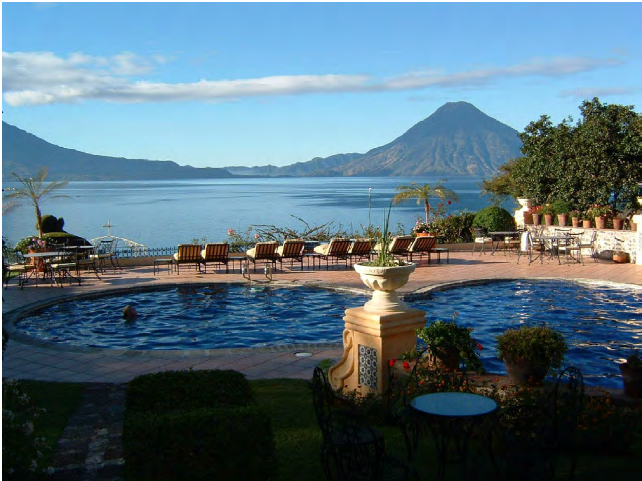
Hotel Atitlan and gardens

Friday, August 9, 2024 This morning join us for a boat ride on magnificent Lake Atitlan and enjoy a breakfast buffet on the boat. We also float over several sunken cities, whose pottery dates to around the time of Christ (see 3 Nephi 8 & 9 and references to Mocum, Onihah, and “American” Jerusalem). Recent underwater mapping expeditions have discovered at least five different sunken towns/cities, including houses and streets, and a palace with stela and altar (pictured above). Explore Santiago Atitlan, a town on the other side of the lake and seat of one of the most traditional Maya regions in existence. See the beautifully woven blouses of Maya women, embroidered with birds and flowers, or the colorful pantaloons of the local men. Shop for more art products, including "Atitlan Style" paintings that are now beginning to show up in the art galleries of New York. On the way back, enjoy a brief discussion on the Waters of Mormon. In the afternoon, we see pottery artifacts brought up from the sunken cities by scuba divers at the Lake Atitlan Lacustrine Museum, and then enjoy the wonderful gardens at the hotel. For the evening, enjoy another at the lovely Hotel Atitlan (breakfast and dinner included).