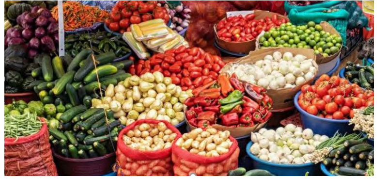
Above Left: Native Maya women dressed in traditional “huipils”, or blouses. Above Right: Vegetable market at Almalonga.