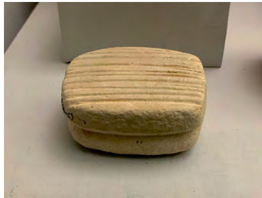
Above: Sling stones and a bark paper beater for making books, from Ceibal.