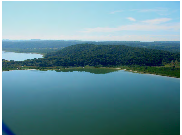
The Yaxha Park Area: Aerial of the jungle at Yaxha and Lake Yaxha