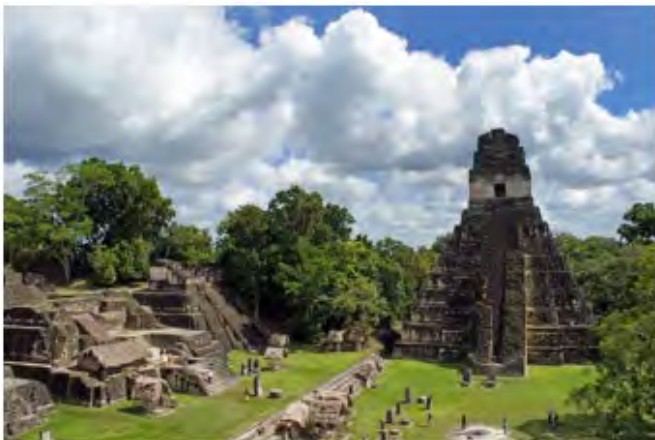
The Great Plaza