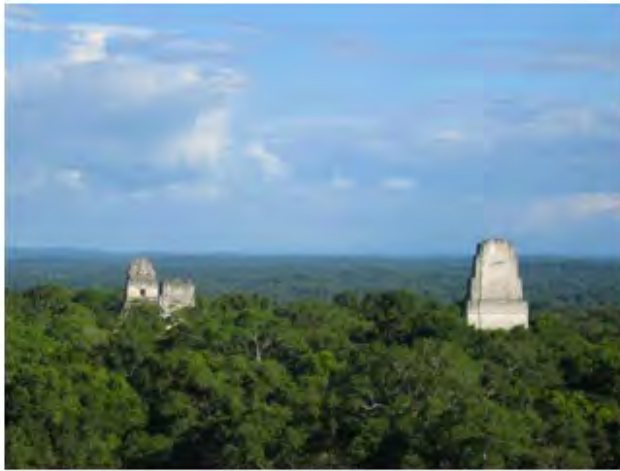
Temples Above the Forest Canopy

Wednesday, August 7, 2024 Your ancient America tour continues today at the ruins of Tikal (Tee-call), perhaps the greatest of all American ruins restored for tourists. In the morning after breakfast, we take a short drive to Tikal. Hands-down, these ruins are considered by most travelers as the most impressive anywhere in the Americas. At the ruins you will enjoy the day viewing towering pyramids with breathtaking temples set in the heart of the jungle. Those who feel up to it will climb Temple IV, and view Tikal's tallest pyramids poking out of the top of the jungle's canopy forest. Here you can view the towering tropical jungle in all its beauty, with toucans, parrots, monkeys, and other animals. Tikal dominated these lands, and adjacent lands, around 300-400 AD, the times of Mormon and Moroni. Were its Generals rivals to these Book of Mormon heroes? During this century, Tikal went on a campaign to conquer or bring under control much of these lands, including those we visited on the river, and was a "superpower" of these regions for much of the next 400 years (400-800 AD). At Tikal, we discuss the end of Book of Mormon civilization, rounding out the chronology of events we have discussed on this tour. We enjoy dinner and our stay again for a final night at the Camino Real Tikal Hotel (breakfast and dinner provided).