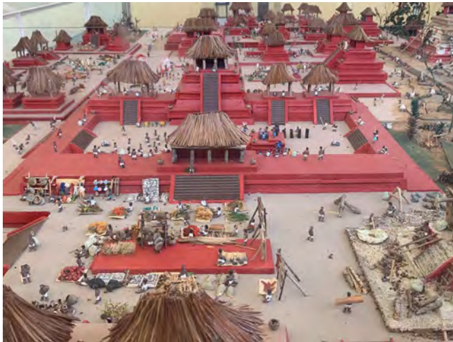
Above left: Map model of ancient Kaminaljuyu.

Sunday, August 4, 2024 Today we explore the Valley of Guatemala, the largest high mountain valley in the mountains of Guatemala. This place has been inhabited since before 1000 BC, and possibly holds the longest continuously inhabited city in the Americas (3000+ years). It is a prime candidate for the Land of Nephi, with its many ruins that date from 600 BC to the time of Christ. The largest ruin in the valley, and the ancient capital city, are the ruins of Kaminaljuyu, or “KJ” for short. These ruins were largely intact up until the 1980s, when the expanding modern Guatemala City swallowed most of them up. Archaeology was done before then, so we know a good deal, and parts of the ruins remain. We will learn of this place at the Miraflores Museum, with a wonderful map model of the ancient city, as well as Kaminaljuyu Park, where a sector of the ancient city remains. Here, we tell stories of Nephi, and how he founded his city, and land, a prosperous sanctuary for the Nephites. In the late afternoon we fly north over the mountains and down to the jungle areas near sea level, to Flores, the capital of the northern “department” of Guatemala. We stay on the shores of Lake Peten Itza, the 2 nd largest lake in Guatemala, which was ringed anciently by many cities. Our hotel is the 4 Star Camino Real Tikal, our base for the next 4 nights. (breakfast and dinner included).