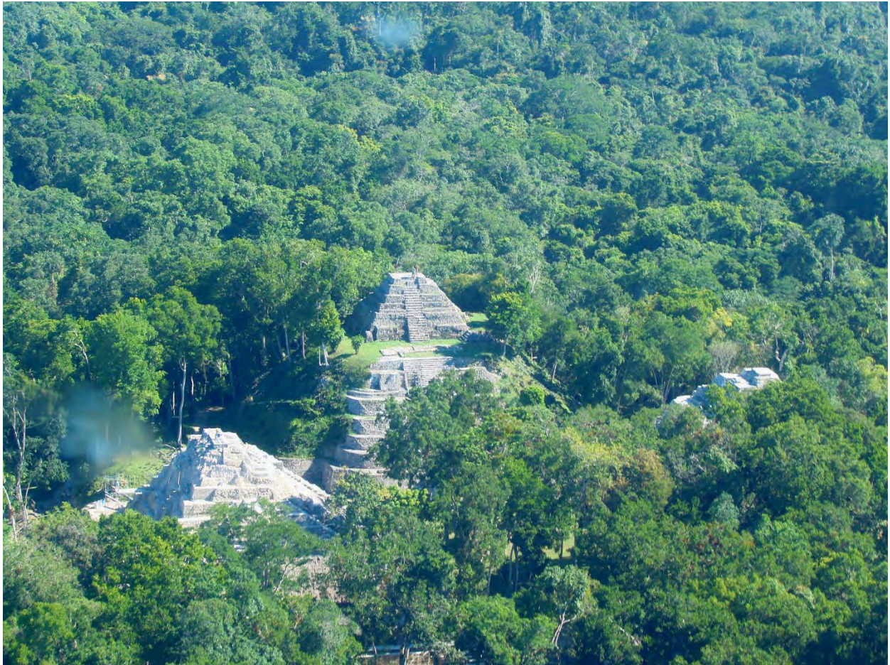
Above: Triad pyramid complex at Yaxha, dating into B.C. times.