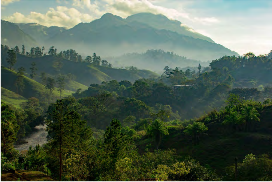
Left: The rugged mountains of central Guatemala.