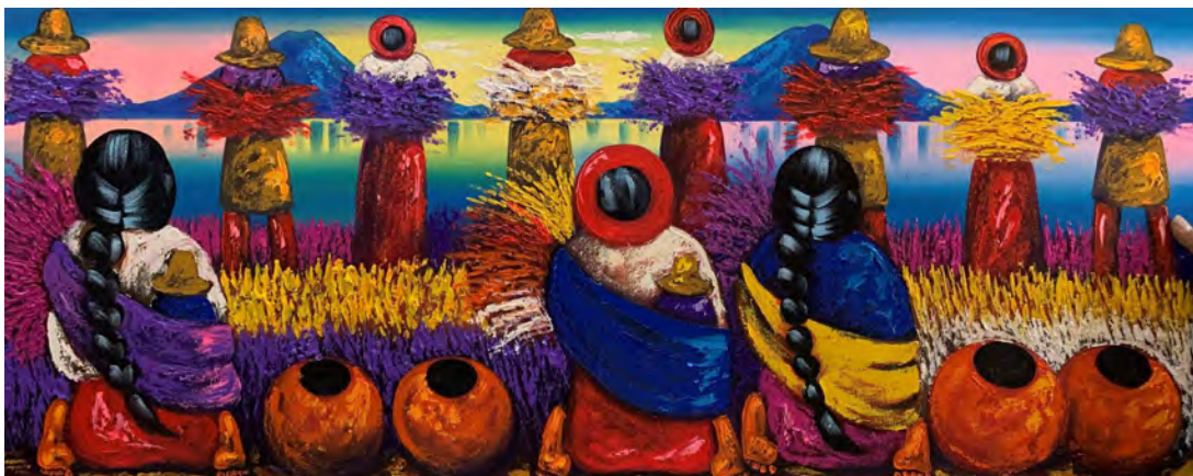
Atitlan Art Style: Santiago Atitlan Market