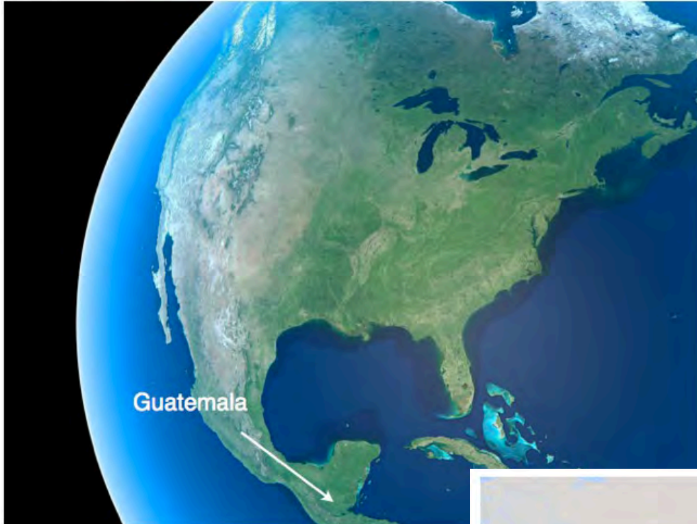
Satellite View of Guatemala

Monday, July 29, 2024 We leave today for a grand Book of Mormon adventure! Flights from our various points of origin take us to Guatemala City, Guatemala, the modern and ancient capital of Guatemala. Upon arrival, we pass through customs and then take our private bus to the hotel (or the hotel shuttle if your flight arrives at a different time than the majority of the group). In the evening, dinner will be provided at the hotel.