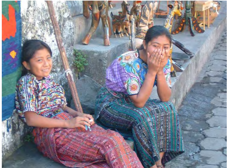
Above: Native Maya girls from Patzicia, location of 1 st converts to The Church, and Maya girls of Santiago Atitlan.