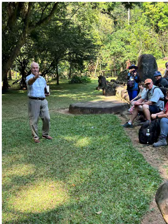
Below: The Palace of the king, and location of tomb discovery: 500-600 B.C.