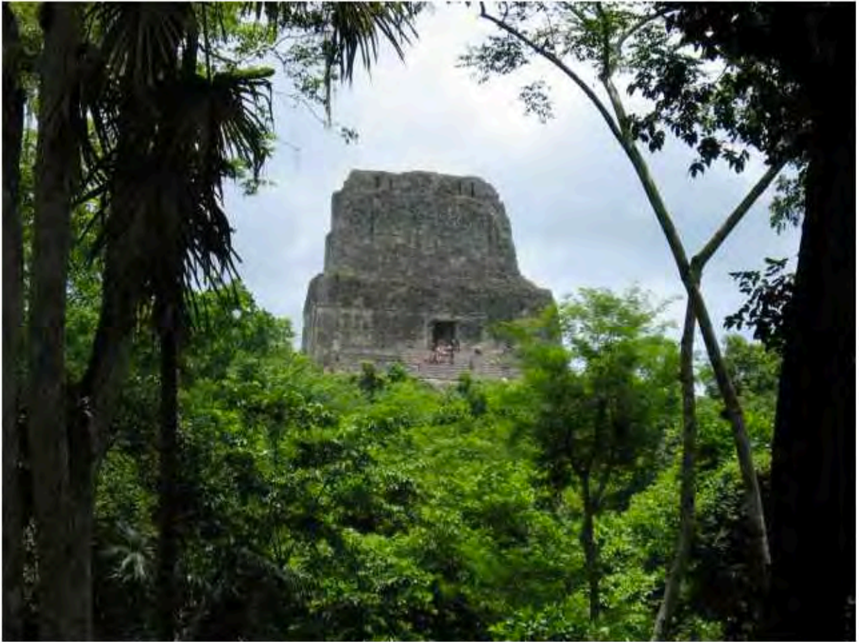
Temple 4, Towering above the Forest