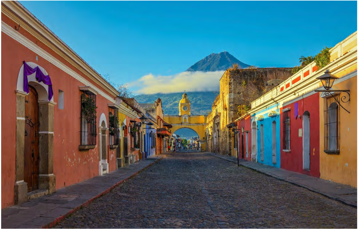
Another view of the Santa Catalina Arch, with Agua Volcano behind