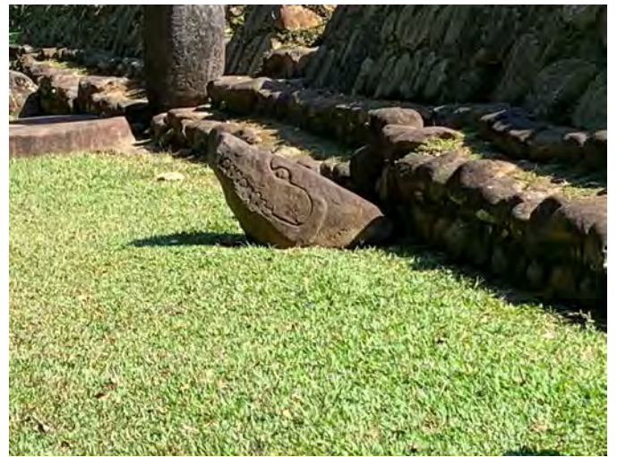
Above Left: Rows of stone monuments at the base of pyramid ruins.