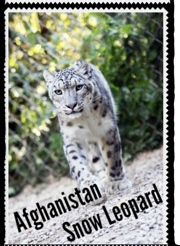
Afghanistan Snow Leopard

CONGRATULATIONS! The Passport Club salutes the following world traveler who successfully earned GEOWIZ STATUS during the _____ school year. CONGRATULATIONS! FELICITATIONS! MABROUK! MAZELTOV! JOLLY GOOD!