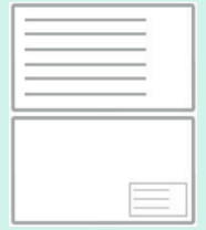
Registration card / Specimen tube label