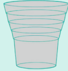
Urine collection cup