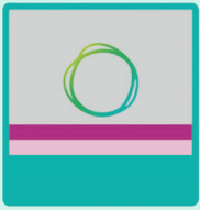
Instructions for use