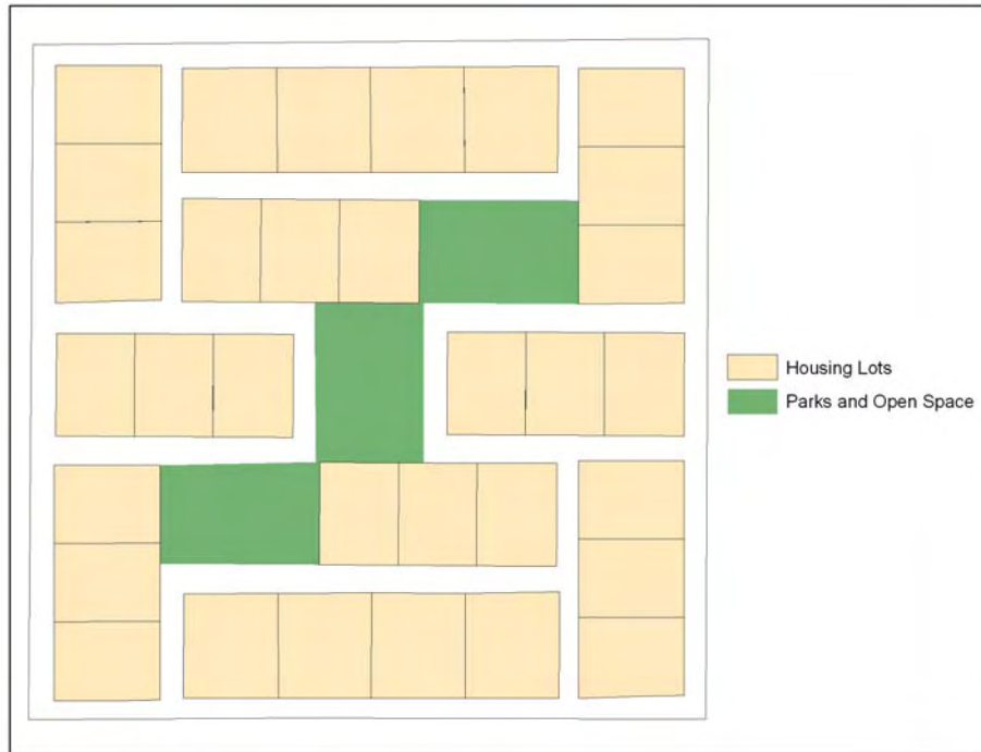
Figure 2: Fused Grid Design

options, road connectivity, and efficient traffic flow, while concurrently protecting open-space lands. Figure 2. displays one example of fused grid design.