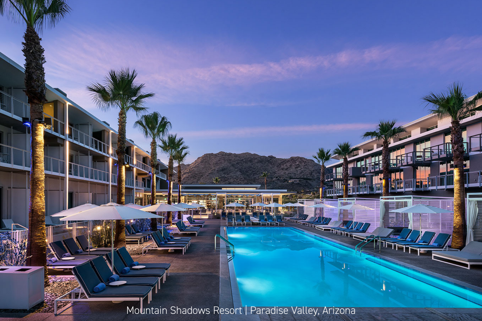
Mountain Shadows Resort | Paradise Valley, Arizona