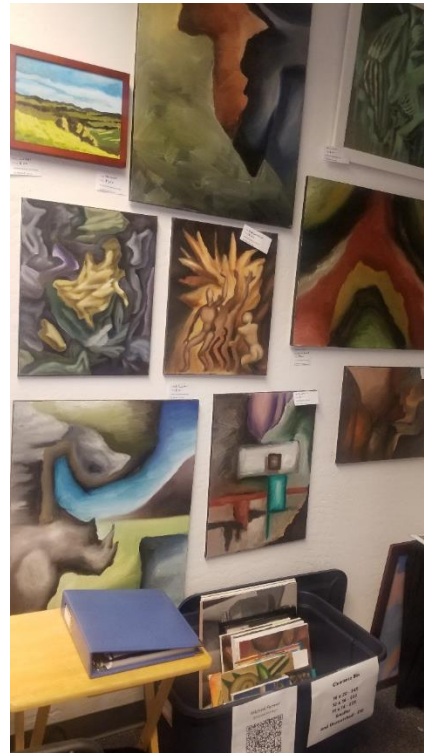
MESA ART LEAGUE STUDIO 9 AT THE ONEOHONE GALLERY DOWNTOWN MESA SEPTEMBER'S FEATURED ARTIST IS JUDITH BUTORAC