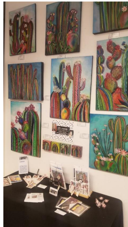
TAMMIE PURSLEY'S WORK AT STUDIO 9