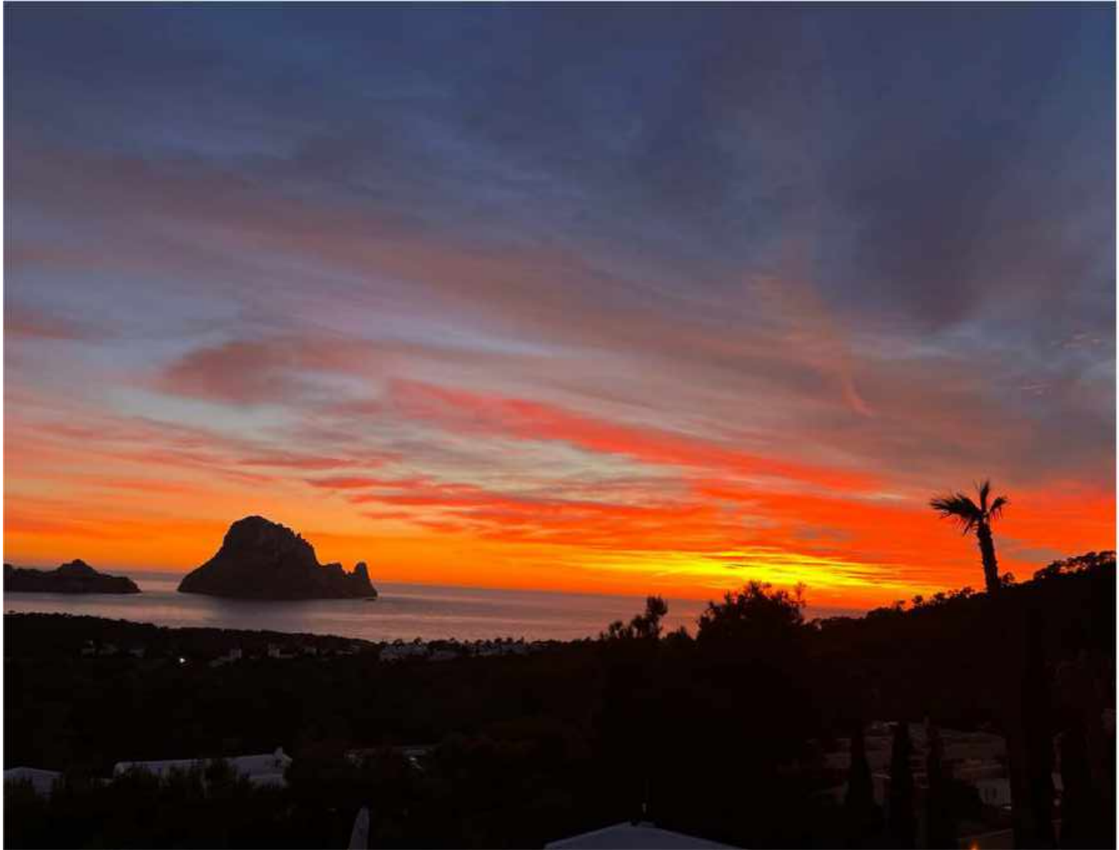
Front view Villa on Es Vedra Magical Rock