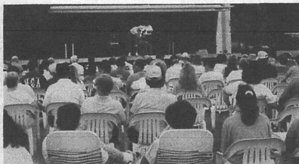
Sunday morning's awards ceremony was attended by over 200 people. It made for a relaxing and entertaining finish to a great National show.