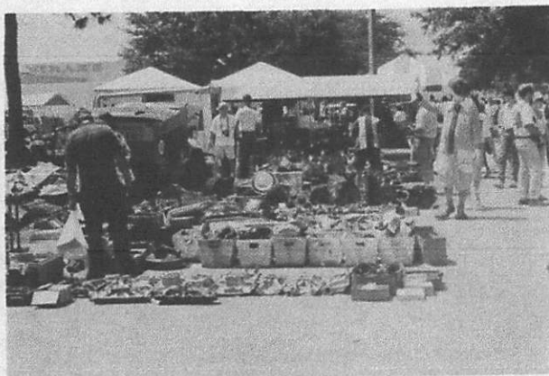
A good collection of vendors made the scene with new and old parts alike for sale. Check out the selection of intake manifolds in the foreground.