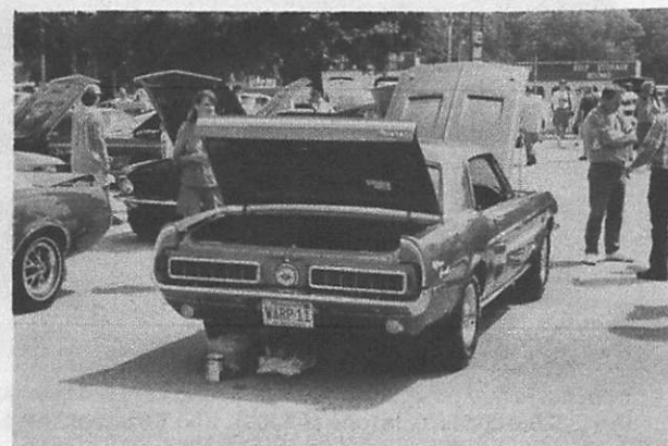
A California Special from Massachusetts at the Nationals in Pensacola Florida! No wonder he has to drive it at "Warp II".