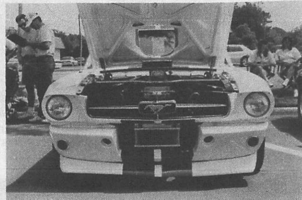
This tunnel-rammed Shelby required a slightly 'notched' hood to clear the induction. Imagine this sight in your rearview mirror.