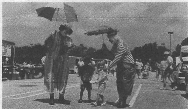
The mood of the Pensacola show was festive for all including these two young Mustang enthusiasts seen here chatting with the designers for the new Camaro.