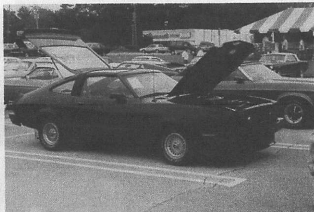
Mustang IIs are popping up at shows more and more these days. A gorgeous example was this '78 King Cobra with factory 302.