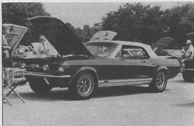
This GT convertible was just one of several impressive '67s that showed up for the event.