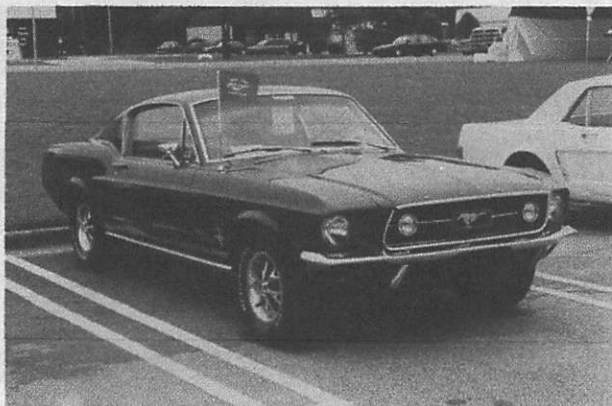
There's only one thing to say about this ruby red '67 fasback; "We want it".