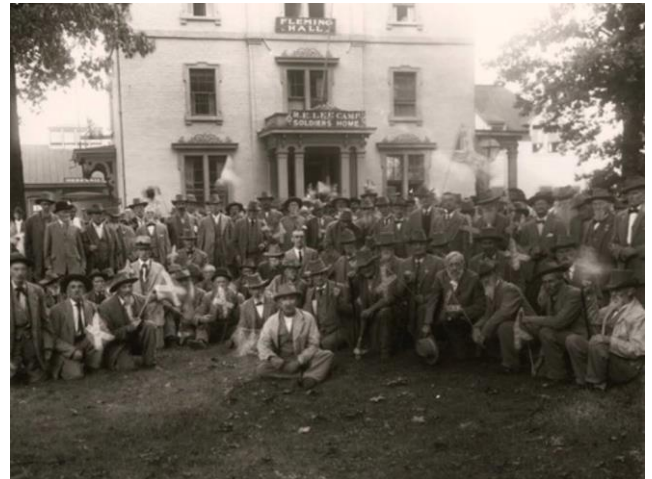
R. E. Lee Camp Soldiers Home in an early 1900s picture

On October 30 th , the Camp sent a $100 donation to the Confederate War Memorial Chapel in Richmond. We have supported the chapel for several years by sending monies for them to use as needed. This is the chapel at the Confederate Soldiers Home in Richmond which is on the grounds now occupied by the Virginia Historical Society and the Virginia Museum of Art.