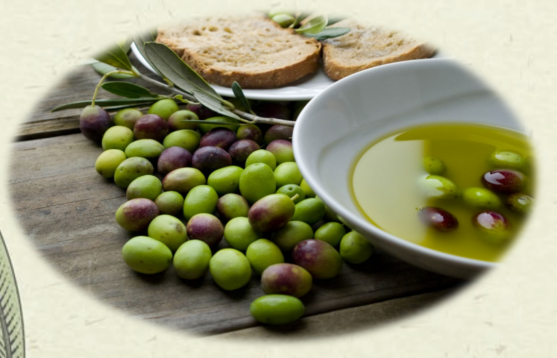
Coratina Olives, native to our origin foundations in Bari, Italy.

Home of "Fruttato di Coratina", known as the highest quality Extra Virgin Olive Oil in the industry.