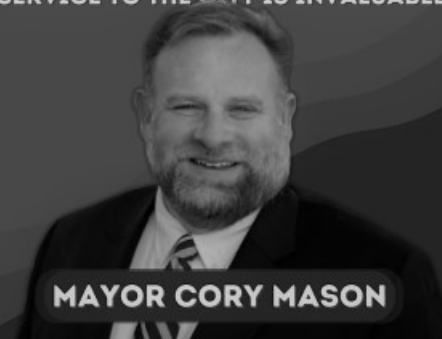
MAYOR CORY MASON

"ON BEHALF OF THE CITY OF RACINE, I CONGRATULATE AND THANK THE RACINE INTERFAITH COALITION FOR PROMOTING PEACE AND JUSTICE IN OUR CITY. YOUR SERVICE TO THE CITY IS INVALUABLE."