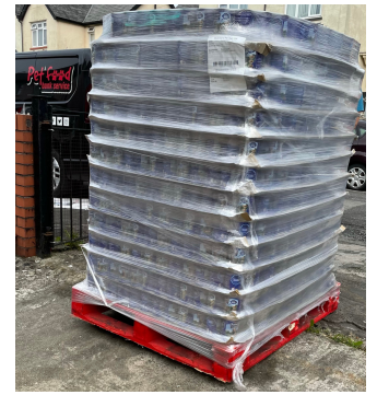
2,500 tins of dog food kindly donated by Butchers.

Our plans from 2020 - 2021 were simple find a regular supply of cat food, a premise's to call home and raise our profile.