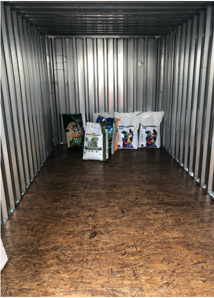
We purchased a shipping container