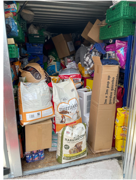
It was full as soon as we built it