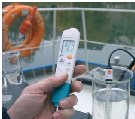
Automatic temperature compensation in external probes with temperature sensor