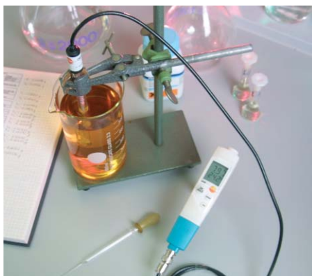
testo 206-pH3 facilitates the connection of external pH probes