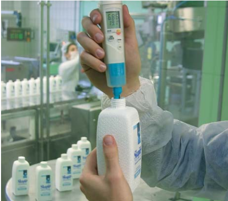
Automatic full scale value recognition and clear 2 line display.