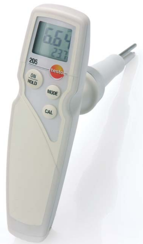
Robust food penetration pH/C° meter with automatic temperature compensation