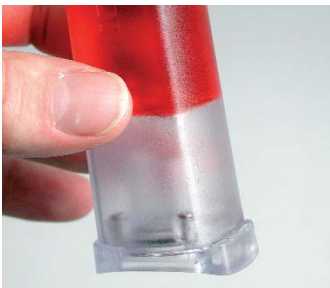
The potassium chloride solution bonded in the gel cannot leak.