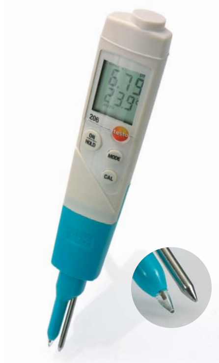
pH2 probe head for semisolid materials