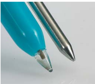
pH2 probe head for semisolid substances

Together with experts from industry and the trades, Testo has developed innovative solutions.