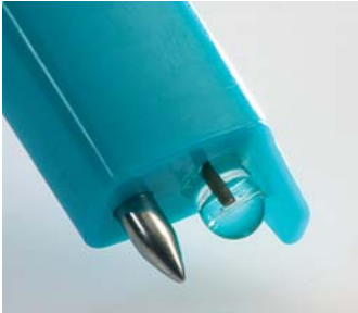
pH1 probe head for liquids

Measurement of the pH value plays an important role in many areas. Anywhere where there are chemical and biochemical reactions, the pH value has an important indicator function.