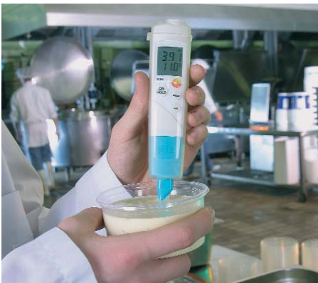
testo 206-pH2 is ideal for measurements in viscoplastic substances.