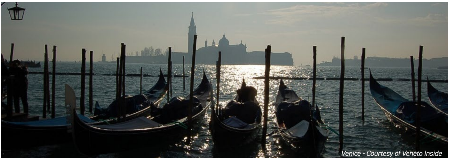
Venice

Any air carrier providing transportation in connection with these tours is not to be held responsible for any act, omission or event during the time the passenger is not on board its planes. The passenger contract in use by the airlines concerned, when issued, shall constitute the sole contract between the airline and the purchase of these tours and/or passenger. Similar responsibility as noted applies to all types of carriers, including car rental companies.