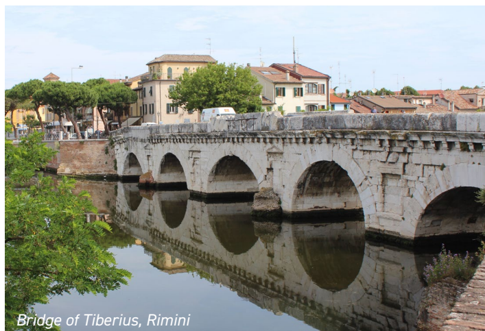
Bridge of Tiberius, Rimini

Minor adjustments may need to be made to our programme due to the scheduling of local events and security arrangements for ceremonies.