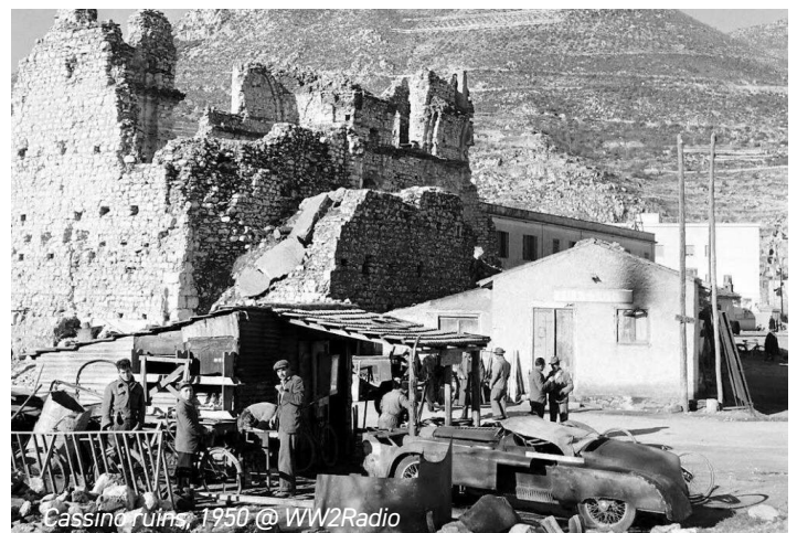
Cassino ruins, 1950

His first book, The Soldiers' General: Bert Hoffmeister at War , won the 2007 C.P Stacey Prize for the best book on a Canadian military history topic and his second, Corps Commanders: Five British and Canadian Generals at War, 1939-1945 , received an honourable mention for the same prize in 2012. His third monograph, The Imperial Army Project: Britain and the Land Forces of the Dominions and India, 1902-1945 , was runner-up for the Field-Marshal Sir Gerald Templer Medal in 2019. Other publications include the edited volumes Capturing Hill 70: Canada's Forgotten Battle of the First World War (2016), Turning Point 1917: The British Empire at War (2017), Military Education and the British Empire, 1815-1949 (2018) and Manpower and the Armies of the British Empire in two World Wars (2021).