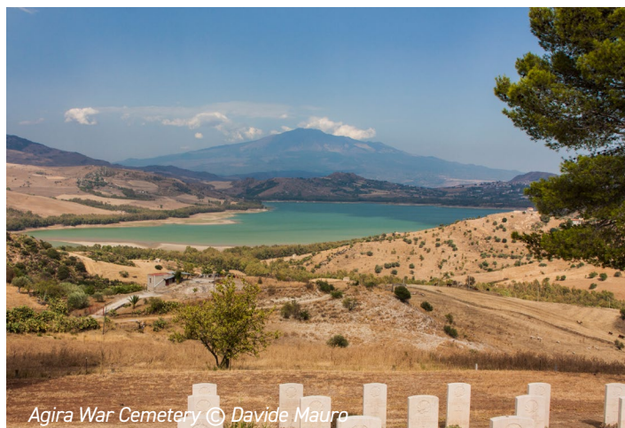
Agira War Cemetery

After a free morning, fly to Rome . Transfer to Cassino (Italy mainland only group will arrive from Rome). Check-in and dinner. (B,D)