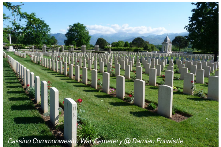
Cassino Commonwealth War Cemetery

Participate in a walking tour of Ortona where the Loyal Edmonton Regiment and Seaforth Highlanders of Canada fought from December 20-28, 1943. Free time in Ortona. (B,D)