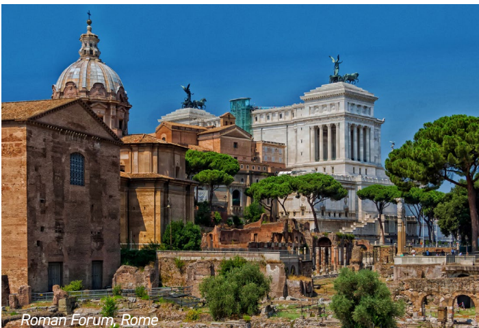
Roman Forum, Rome