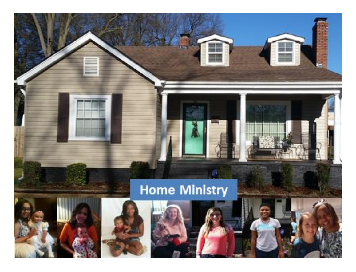
Brought in 22 girls with 6 children into our home