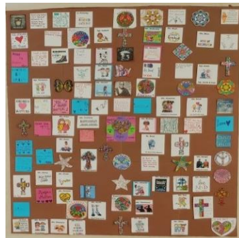
Kindness Program Notes