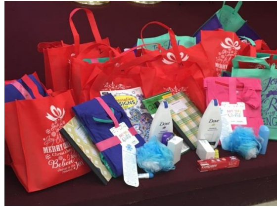
Christmas Party at Columbia DJJ – December 2019