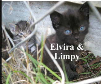
Elvira & Limpy

Sometimes the smallest, home-liest, and most unwanted little ones can take your heart!