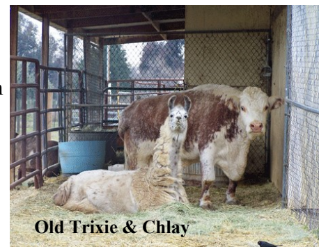
Old Trixie & Chlay

There was no way she was going to be put in that trunk. I helped them (gently) put her in the back seat and I triumphantly started home as she manage to stand up and poop all over the back seat while looking out a window.