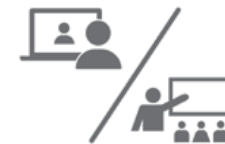
Online + Classroom