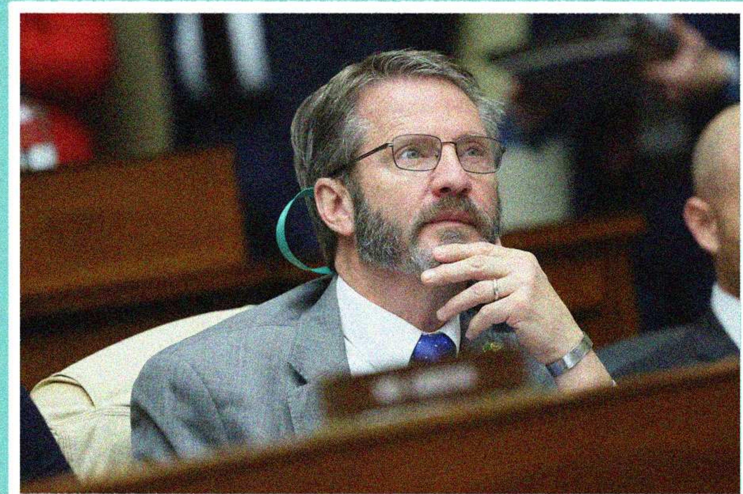
U.S. Representative Tim Burchett

Republican Dennis Hastert was the former Speaker of House from 1999 to 2007. During those years, he was constitutionally the third most powerful man in the country, and he established a reputation in the House as being a strong-arm specialist. Hastert, however, had concealed pedophilic predations for decades throughout his meteoric political ascent. As the revelations about Hastert became increasingly sordid, and the story incited a media feeding frenzy, a federal judge, siding with federal prosecutors, ruled that discovery in the case would not be made public. Then, suddenly, the news about Hastert's predatory behavior quickly evaporated.