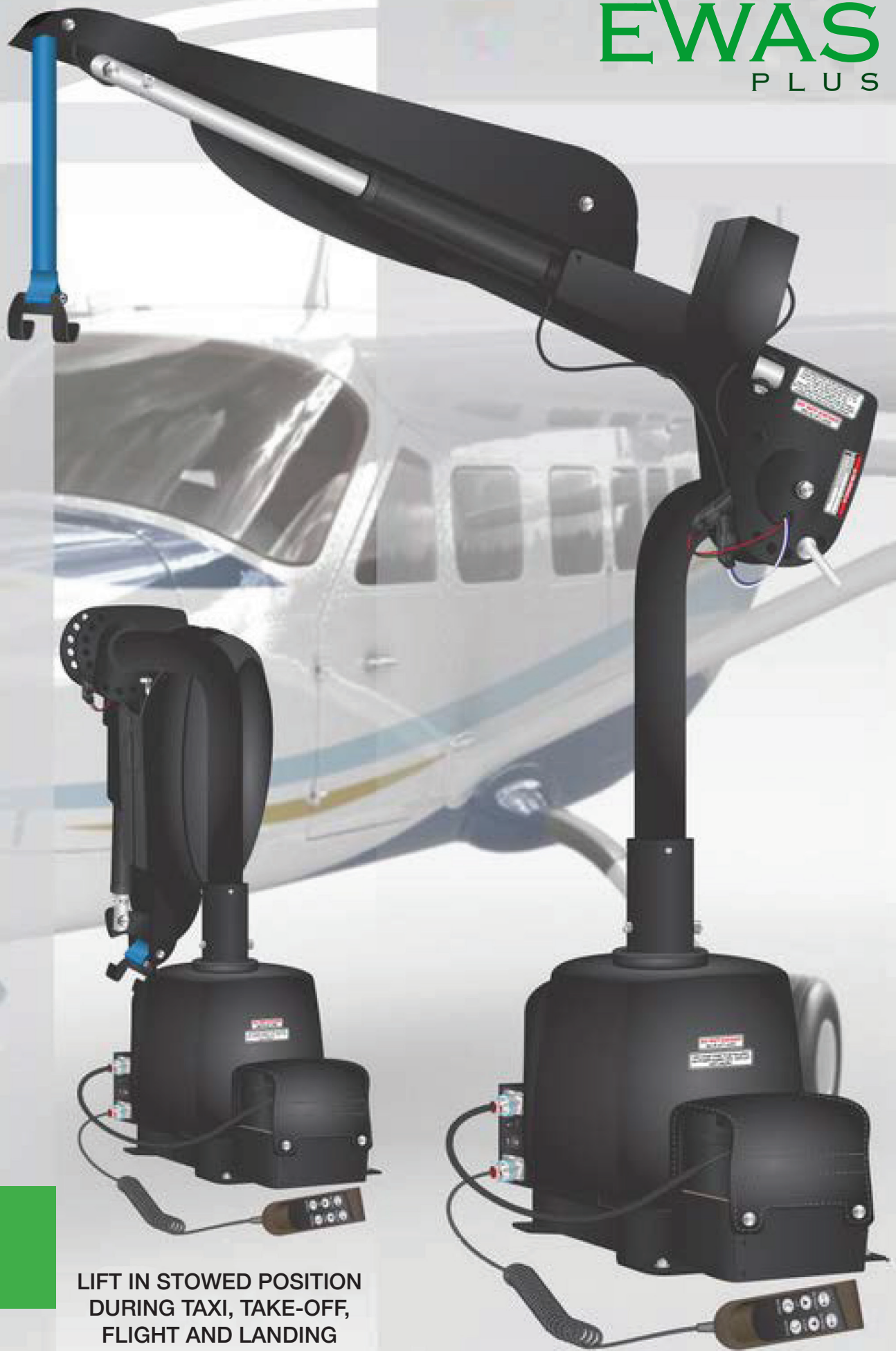
LIFT IN STOWED POSITION DURING TAXI, TAKE-OFF, FLIGHT AND LANDING

CONTACT : 208.863.8208 FOR PRICING AND DELIVERY INFORMATION