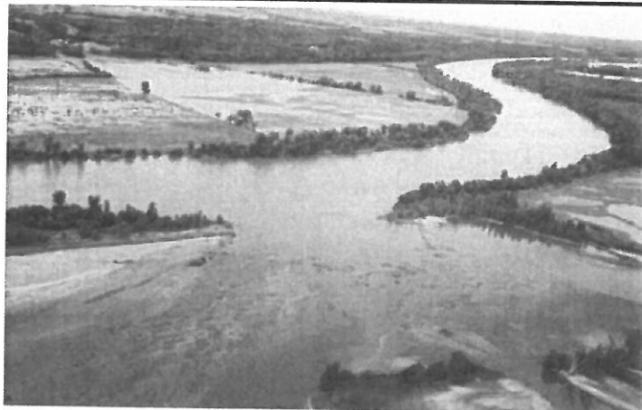
Union Township Overtop Levee Breach, 24 July 2010

Public Law 84-99 (33 U.S.C. 701n) Flood Control and Coastal Emergencies