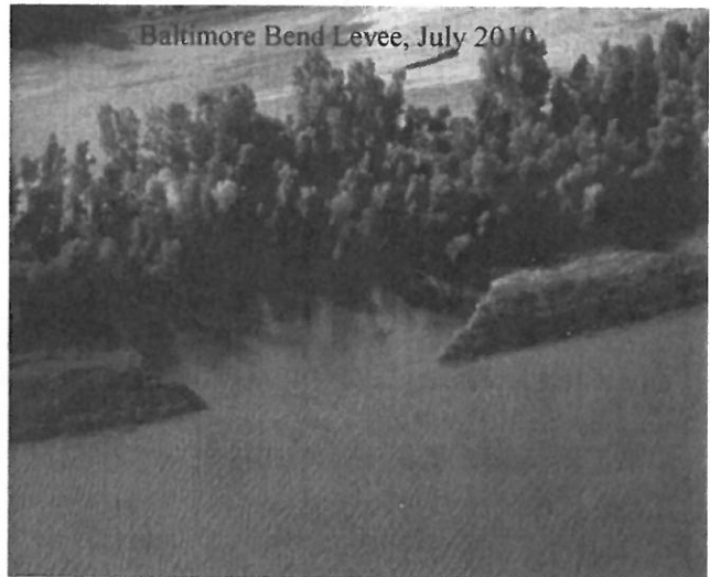
Baltimore Bend Levee, July 2010

A field investigation will be conducted by the Corps and will include an assessment of levee damage and acreage, crops and buildings involved. The sponsor will accompany the team as it identifies damages. The sponsor should provide proof of ownership or sponsorship authority. Necessary agreements will be signed.