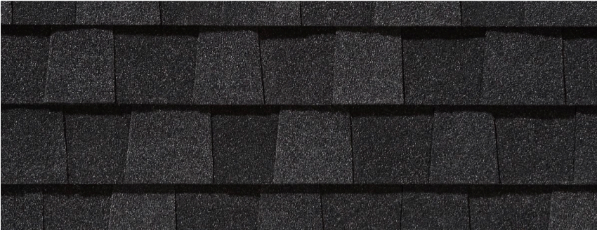
Charcoal Black (Landmark)