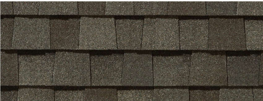
Weathered Wood (Landmark)