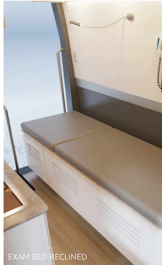
EXAM BED RECLINED