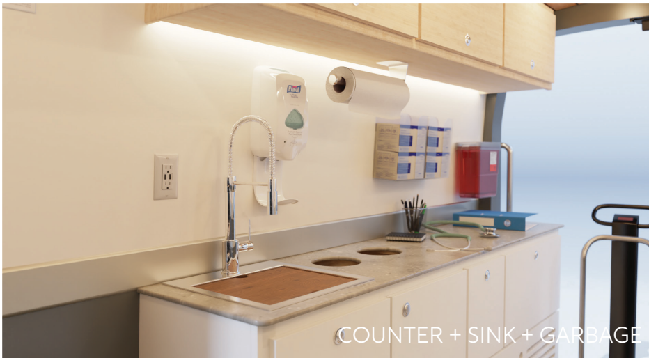
COUNTER + SINK + GARBAGE