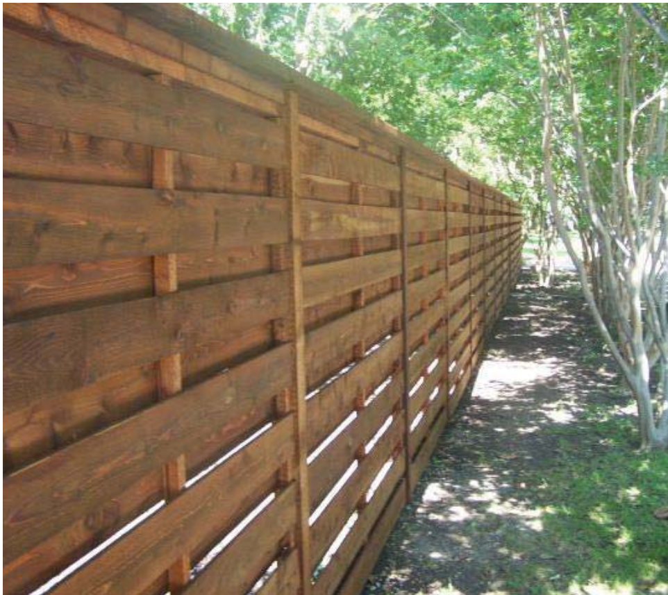
Horizontal Shadow Box Fence