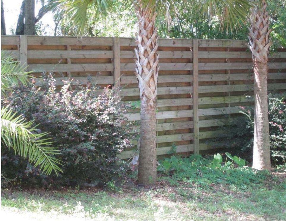
Horizontal Shadow Box Fence