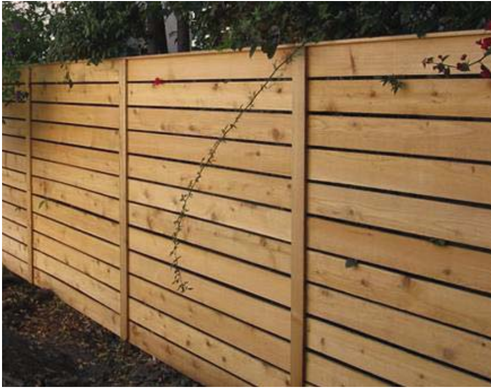
Horizontal Slat Fence