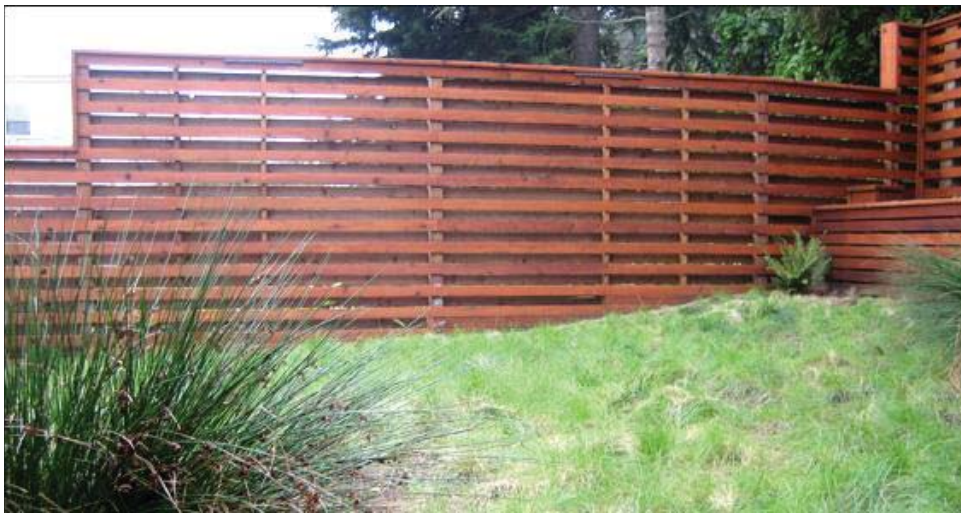
Horizontal Shadow Box Fence