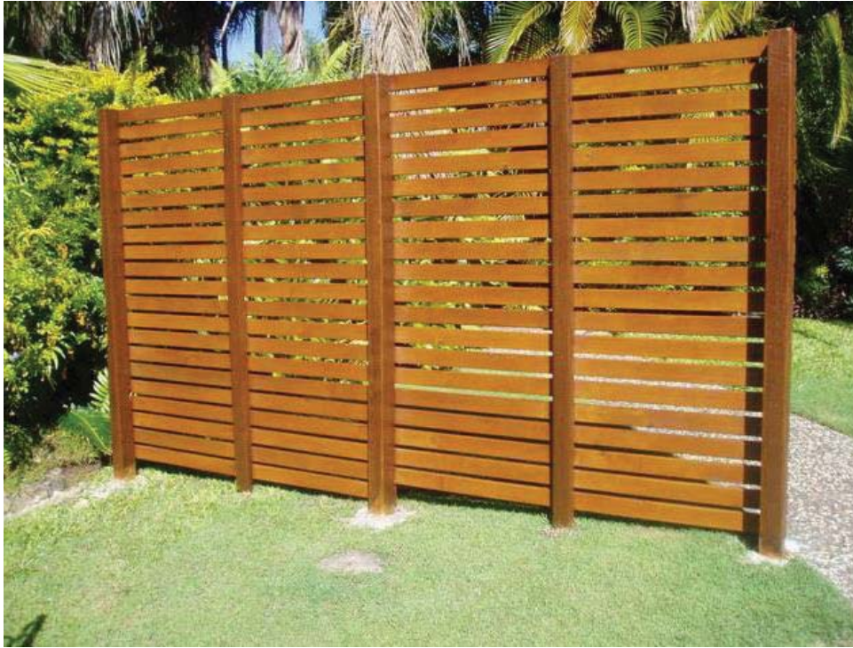
Horizontal Slat Screen Wall