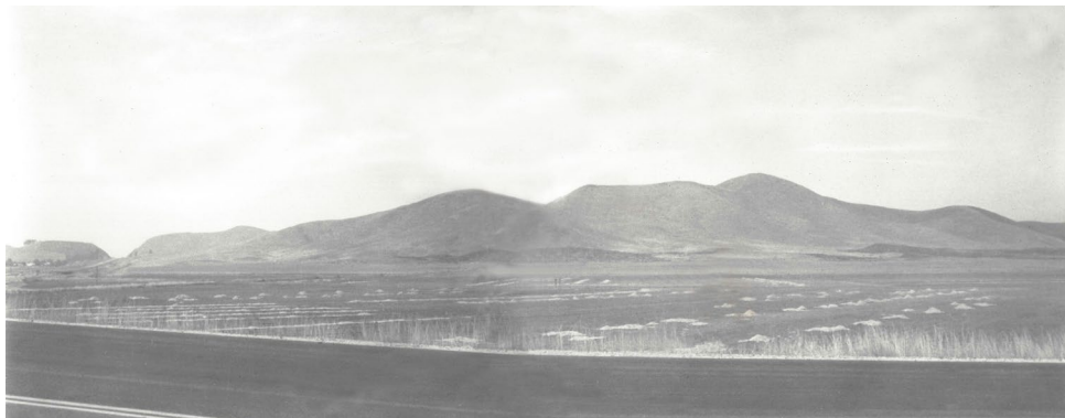
View looking north from Newport Road.

The McCall Ranch property was roughly bounded by Lindenberger, Newport, McCall and Menifee Roads as shown below. At the time, all roads in the area were unpaved. Mr. McCall had to dig 13 wells before finding a sufficient water source to irrigate the alfalfa crop he planned.