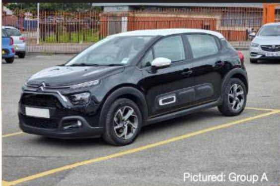
Pictured: Group A