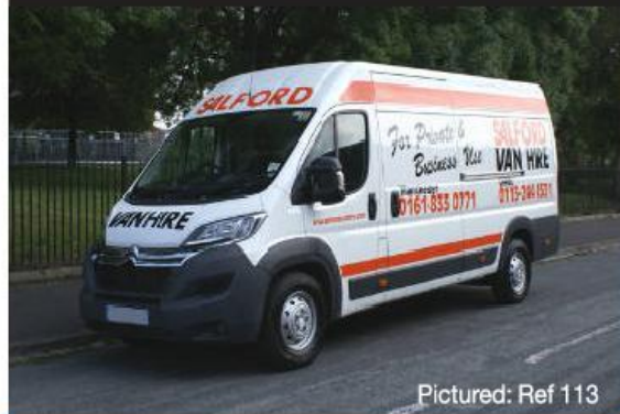
Pictured: Ref 113