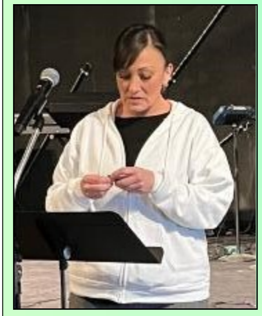
6 mos. Sober 6/2/23