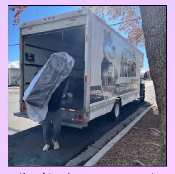
Moved into her new apartment in January 2024