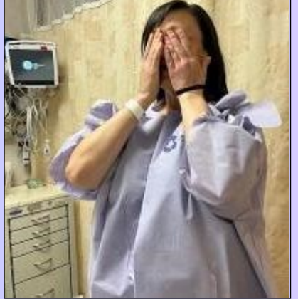
Day Surgery in August