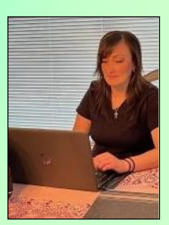
Drug Court Zoom Mtgs