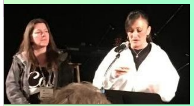
90 days sober Celebrate Recovery 3/23