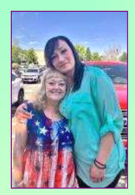
Picnic at South Reno Baptist Church