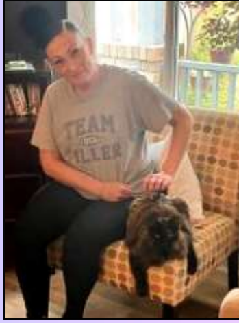
Therapy session in Sept