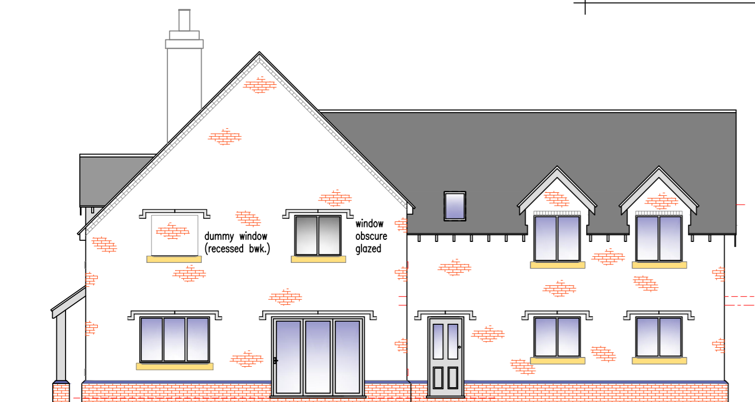
Proposed Side (SW) Elevation

HEADS & CILLS : 'Acanthus' stone label mouldings over door/window as detailed with brick-on-edge lintel to dormer windows. Stone lintels over garage door openings to match cills. Stone cills to all windows as detailed.