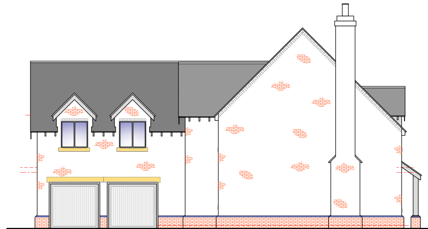
Proposed Side (NE) Elevation