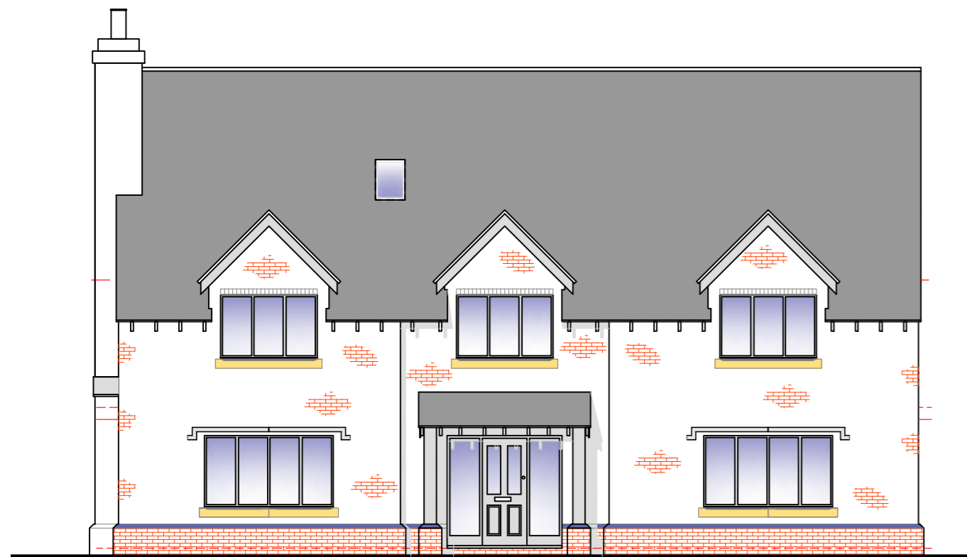
Proposed Front (NW) Elevation to Hall Lane