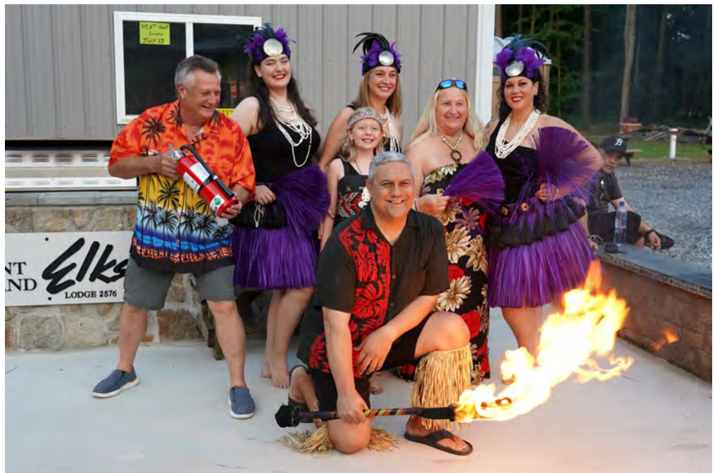
ER Jimmy is following fire safety protocols with the Meki's Tamure Polynesian Arts Group who performed at our Luau