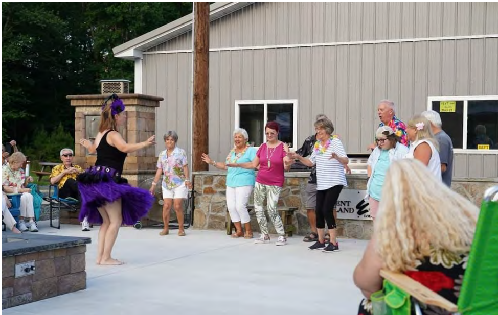
Members show off their Hula Dancing skills