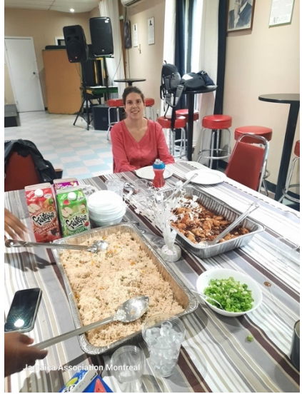
Having a meal at the table