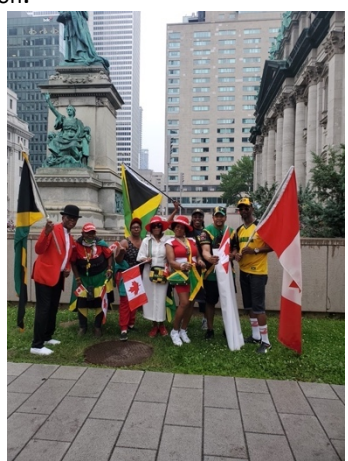
On July 1, 2023, we were proud to participate in the Canada Day Parade where we had 8 participants represent the Jamaica Association.