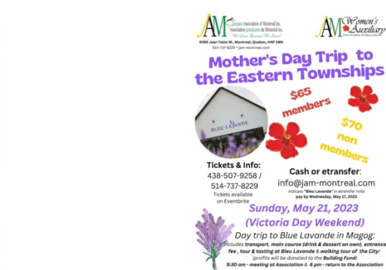
MAY 2023 - Mother's Day