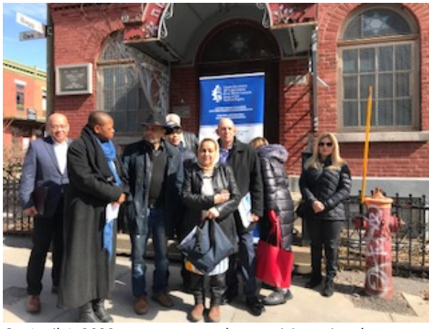
On April 4, 2023, we were proud to participate in advocacy against Anti-Semitism after vandalism at a small synagogue in the Plateau.