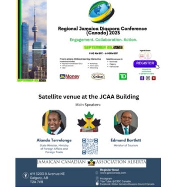
SEPTEMBER 2023 – Regional Diaspora