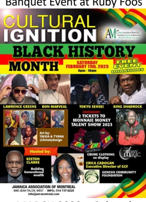
MARCH 2023 – Cultural Ignition