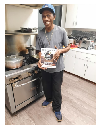
Figure 6: Cool Runnings recipient of Best of the Best Award – Ethnic food category in March 2023

We introduced delivery with Doordash initially to be able to reach a wide audience who appreciate Jamaican food while catering to the different needs of the community. We are also on the Uber Eats platform. A catering service is also available and is proving to be a positive addition to this self-financing venture.