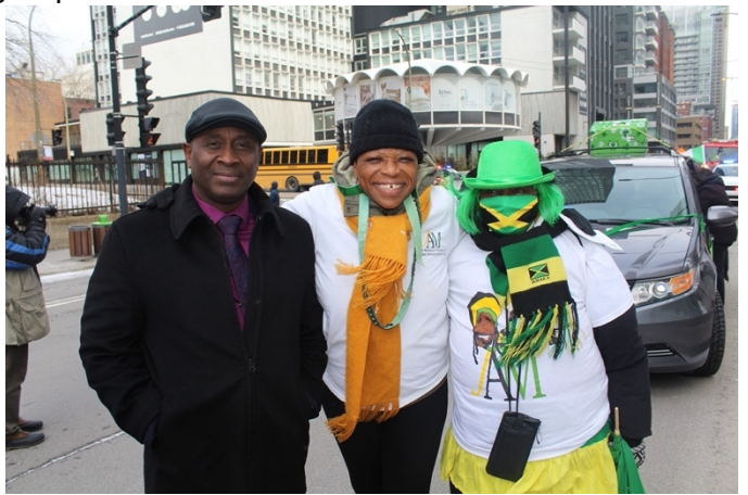
On March 18, 2023, we were proud to participate in the St. Patrick's Day Parade where we had 8 participants represent the Jamaica Association.

Throughout the year, we participate in many activities outside the Jamaica Association to support and encourage community involvement at all levels. These events are both social and community based, particularly with the member organizations of the Montreal Caribbean Coalition Network, but also with B'Nai Brith Canada, CRARR as well as with all levels of government and with the Jamaican government and more. When we can, we donate resources, time and materials to organizations as needed. We have continued to work with the Regional Public Health Department on health issues within the Black communities of Montreal. In addition, we are also collaborating with the <<Black Opportunity Fund>> in their health care group.