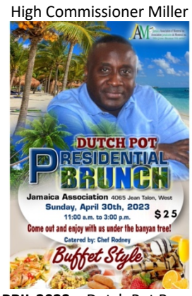
APRIL 2023 - Dutch Pot Brunch