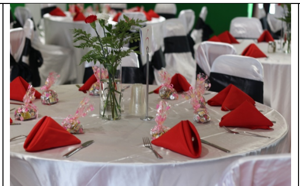
Figure 4: Banquet Hall Set Ups / Rentals