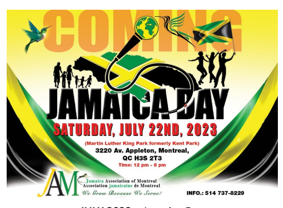
JULY 2023 – Jamaica Day