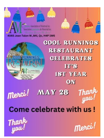
Figure 7:Celebration of 1st year