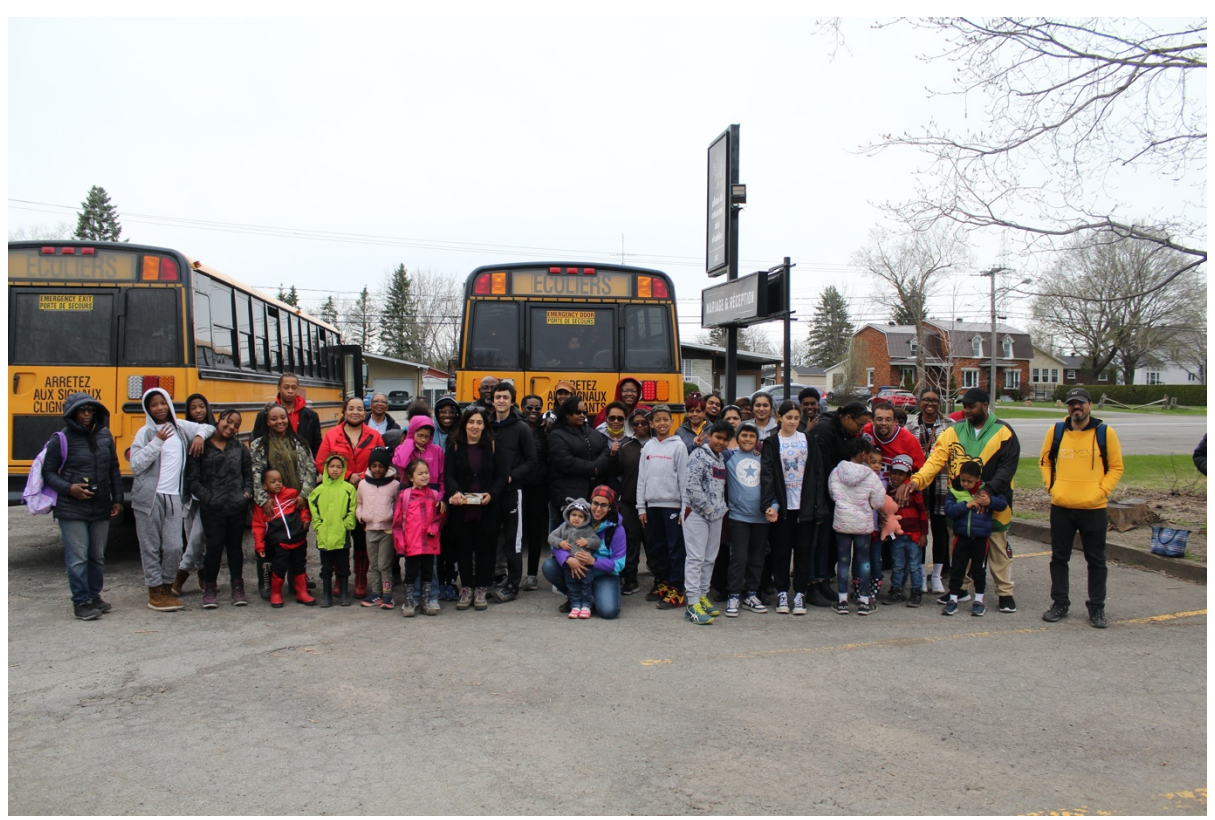
Figure 5 - Cabane a Sucre St. Constantin - April 2023

The number of children varied over time, but we noted an increase in participation from fall 2022 to 2023 for both in person and online.