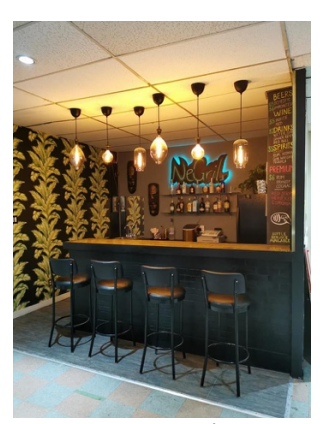
Figure 5: Negril Bar

The Association's Bar is named "Negril". In this fiscal year, the use of security measures and a guard were maintained. There was a record number of patrons who came to the Association on Fridays and Saturdays over the year. As there are no more restrictions, hours of operation are from 9 pm to 3 am on both nights. The level of activity has demonstrated the appreciation of having a bar in our space. This service allows for self-financing activities.