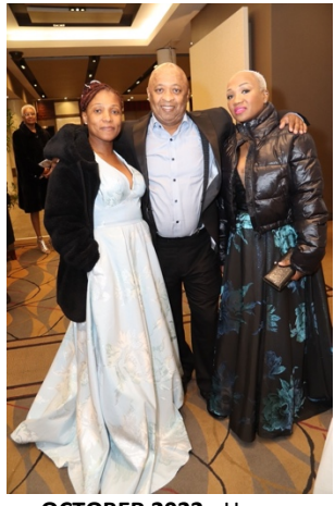
OCTOBER 2022 - Heroes Banquet Event at Ruby Foos