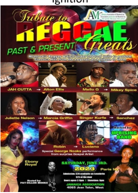
JUNE 2023 - Tribute to the Greats