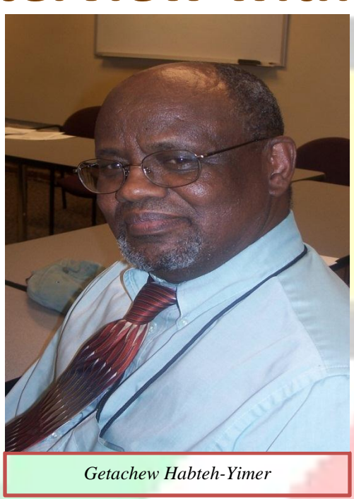
Q: What is your position at ACHI and a brief description of that position?