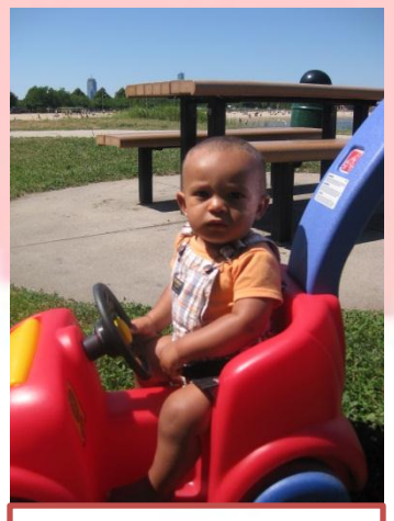
The beautiful weather brought out people of all ages.