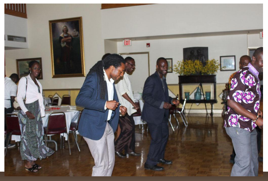
Guests dancing at the banquet