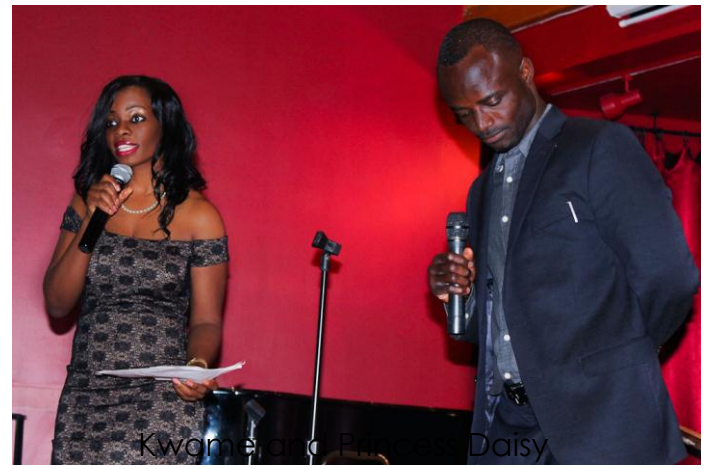
Emcees for the night hosting the banquet