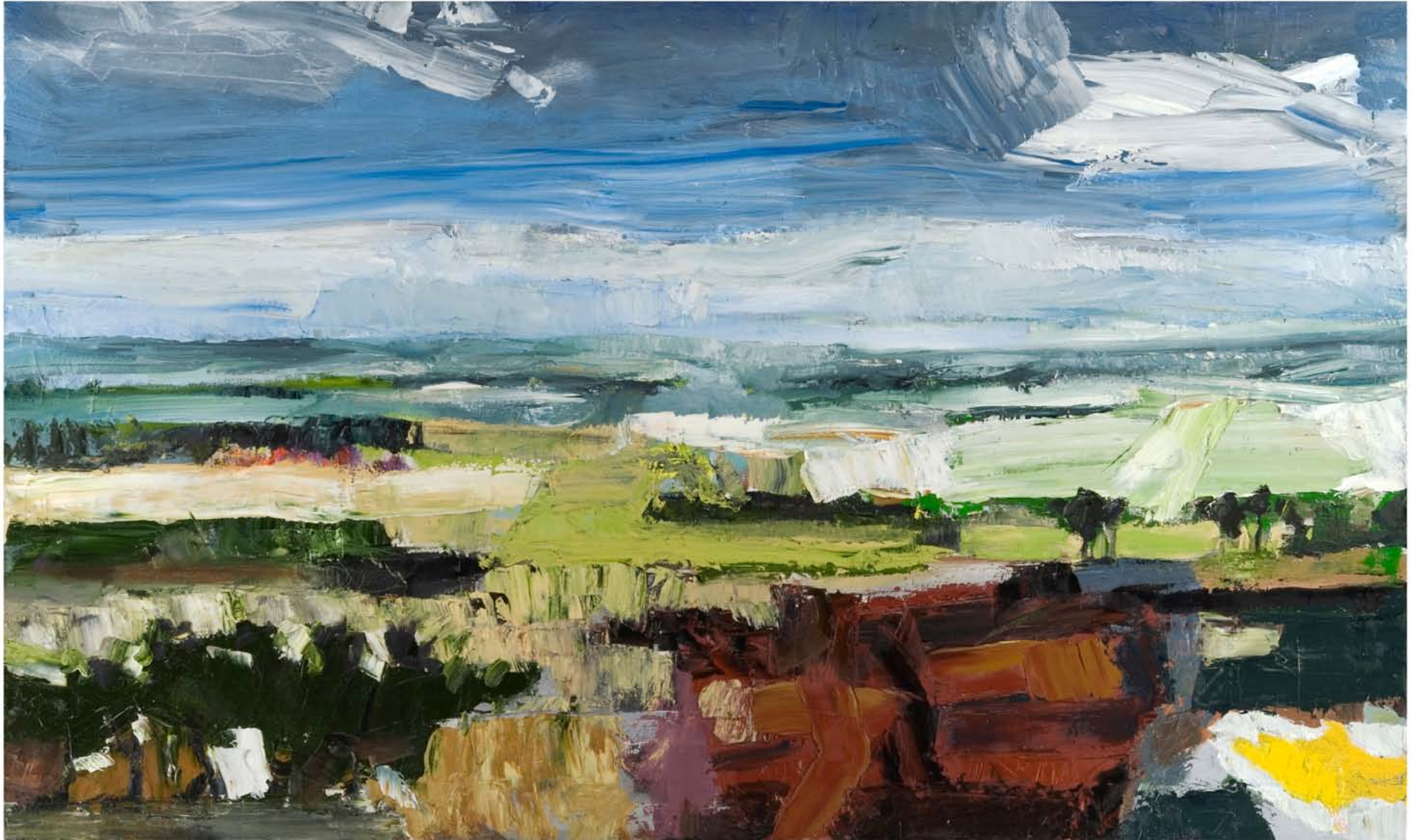
SPRING - PRINCE EDWARD COUNTY OIL ON CANVAS 36" x 60"