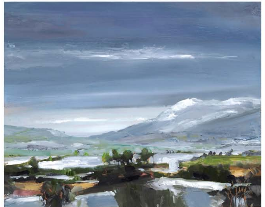
CLOCKWISE FROM TOP LEFT - MELTING SNOW LANDSCAPE OIL 12" x 16" NEAR PENDOWER OIL 12" x 16" WESTERN LANDSCAPE OIL 16" x 20" SENNEN SUN DOWN OIL 13" x 20"