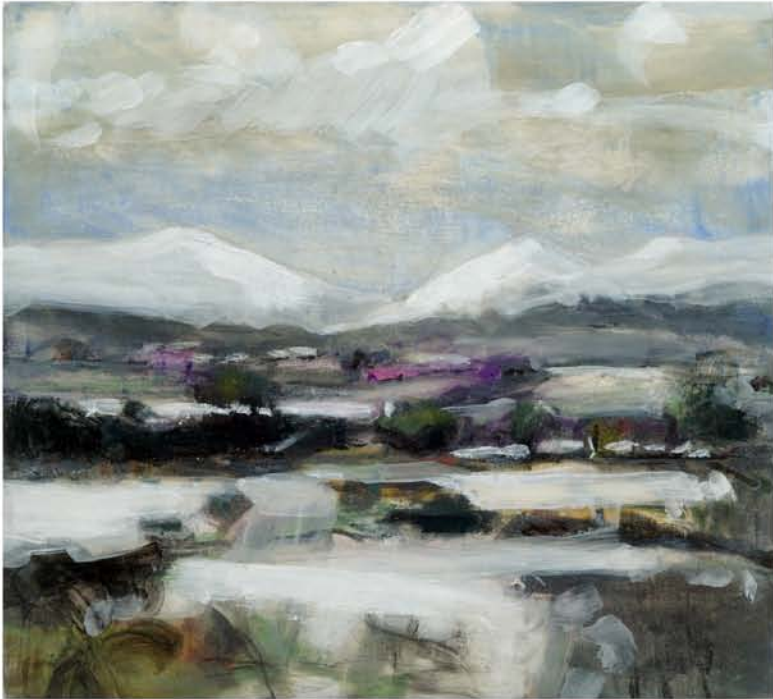
WINTER MOUNTAINS PASTEL ON GESSO 10" x 12"