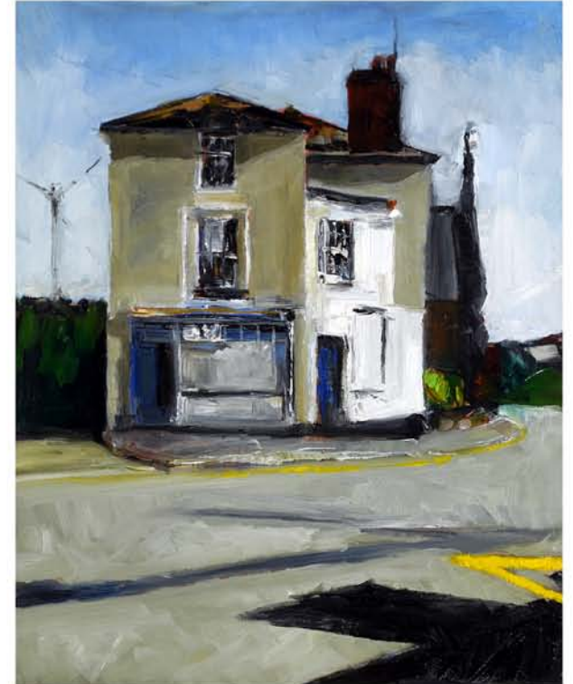
FROM LEFT TO RIGHT - MOUSEHOLE HARBOUR BETWEEN HOUSES OIL 16" x 12" BETWEEN HOUSES, ST. IVES OIL 15" x 12" HOUSE AT THE TOP OF CAUSEWAY HEAD OIL 15" x 12"