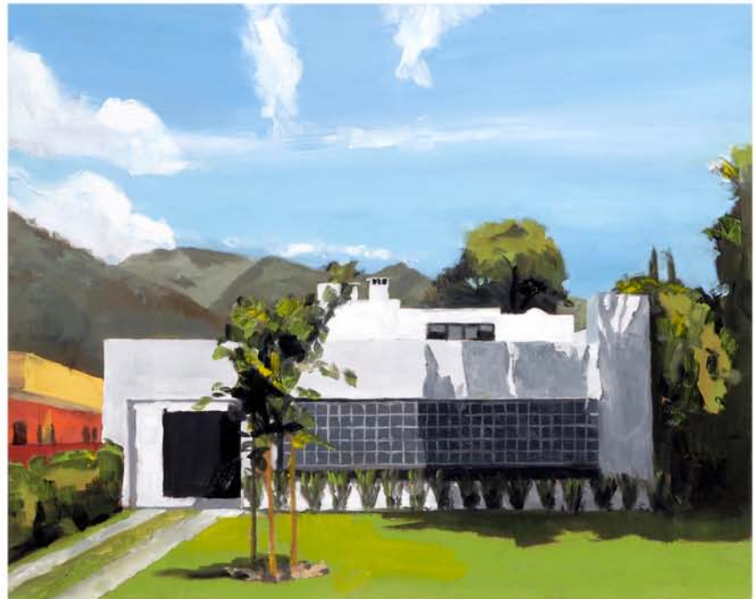
CLOCKWISE FROM TOP LEFT - PATH IN THE SAND OIL 12" x 15" CAPE CORNWALL PAINTED WITH SUNGLASSES OIL 12" x 15" MEXICAN HOME, AJIIC OIL 16" x 20" AJIIC CHURCH OIL 12" x 15"