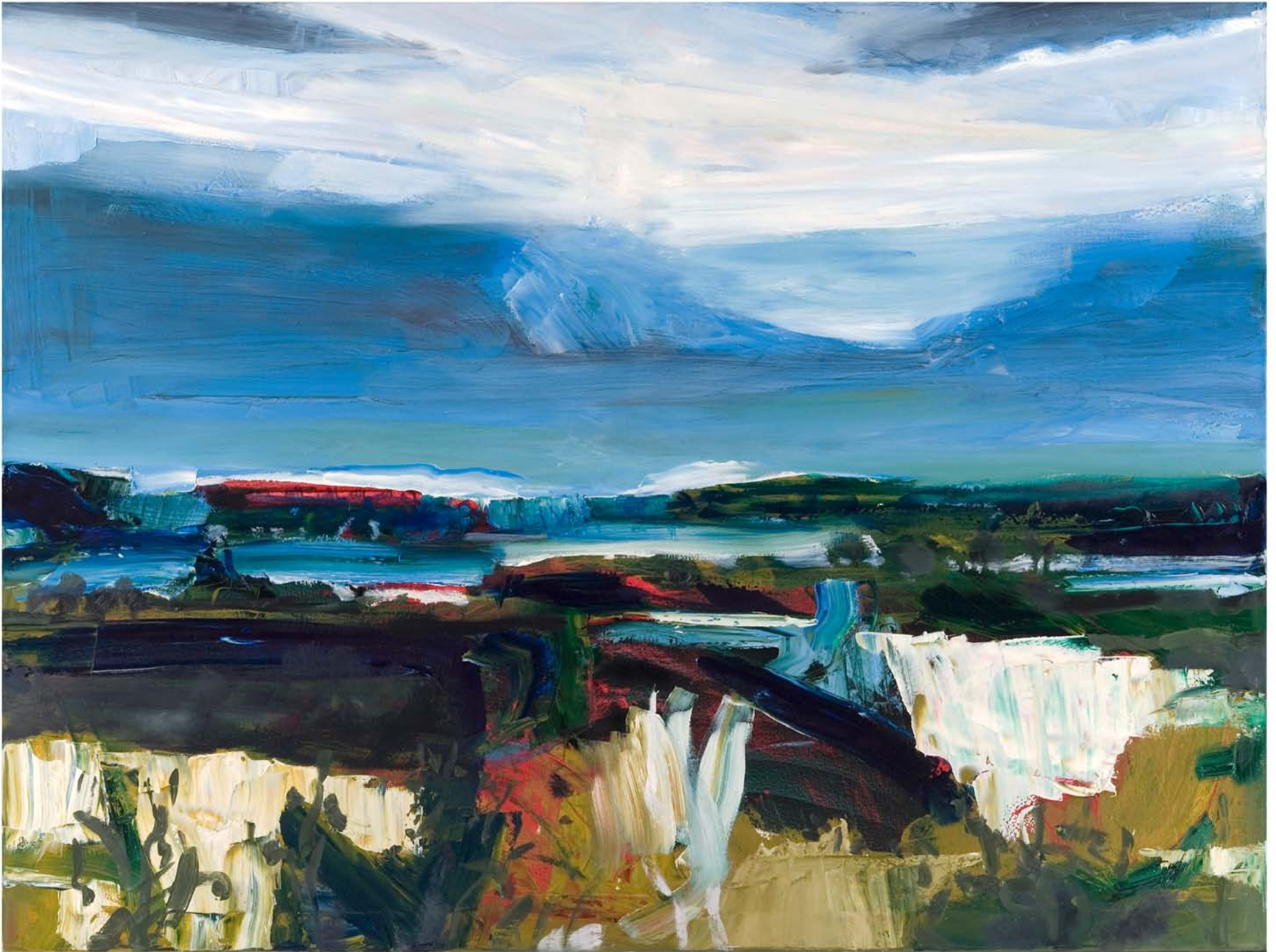
WOLFE ISLAND OIL 36" x 48"