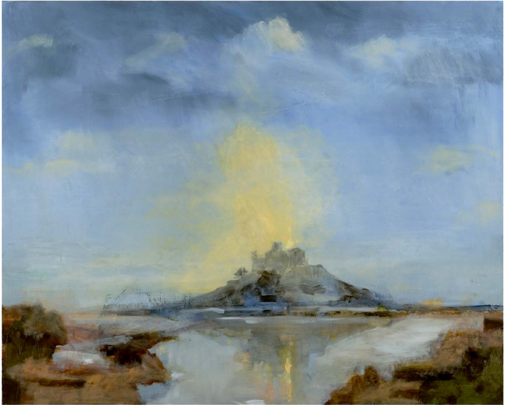
SAINT MICHEAL'S MOUNT AT DUSK OIL ON CANVAS 48" x 60"