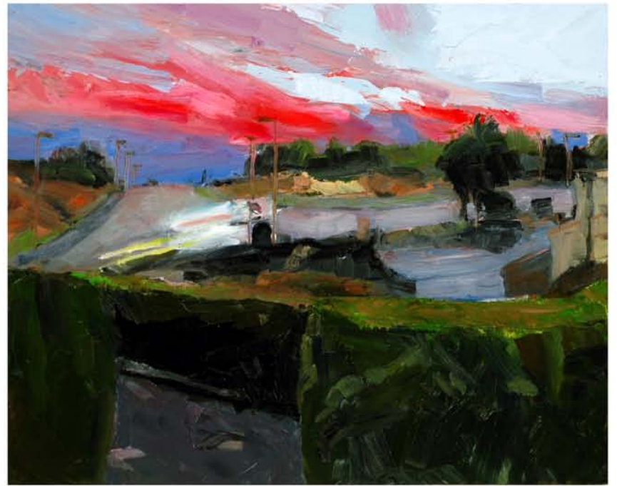
CLOCKWISE FROM TOP LEFT - TOWARDS NEWLYN FROM MOUSEHOLE OIL 12" x 15" HAY BAILS AND FIELDS OIL 12" x 15" B & B NEAR EXETER AIRPORT OIL 12" x 15" FIELDS WITH TREE SHADOWS OIL 12" x 15"