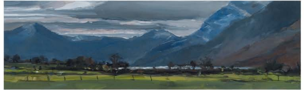
LAKE DISTRICT IN AUTUMN OIL 6" x 20"