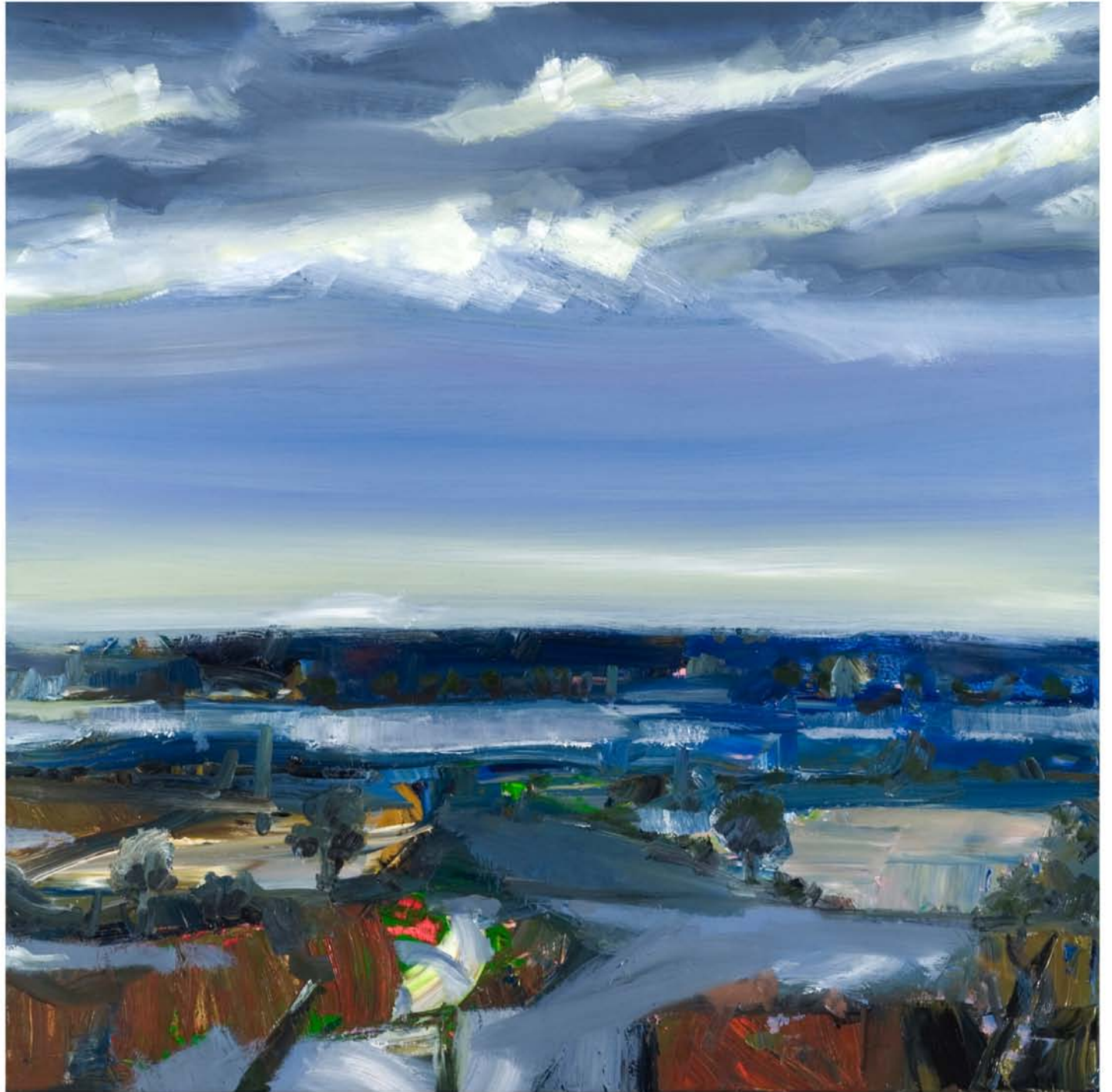
HOWE ISLAND OIL ON CANVAS 36" x 36"