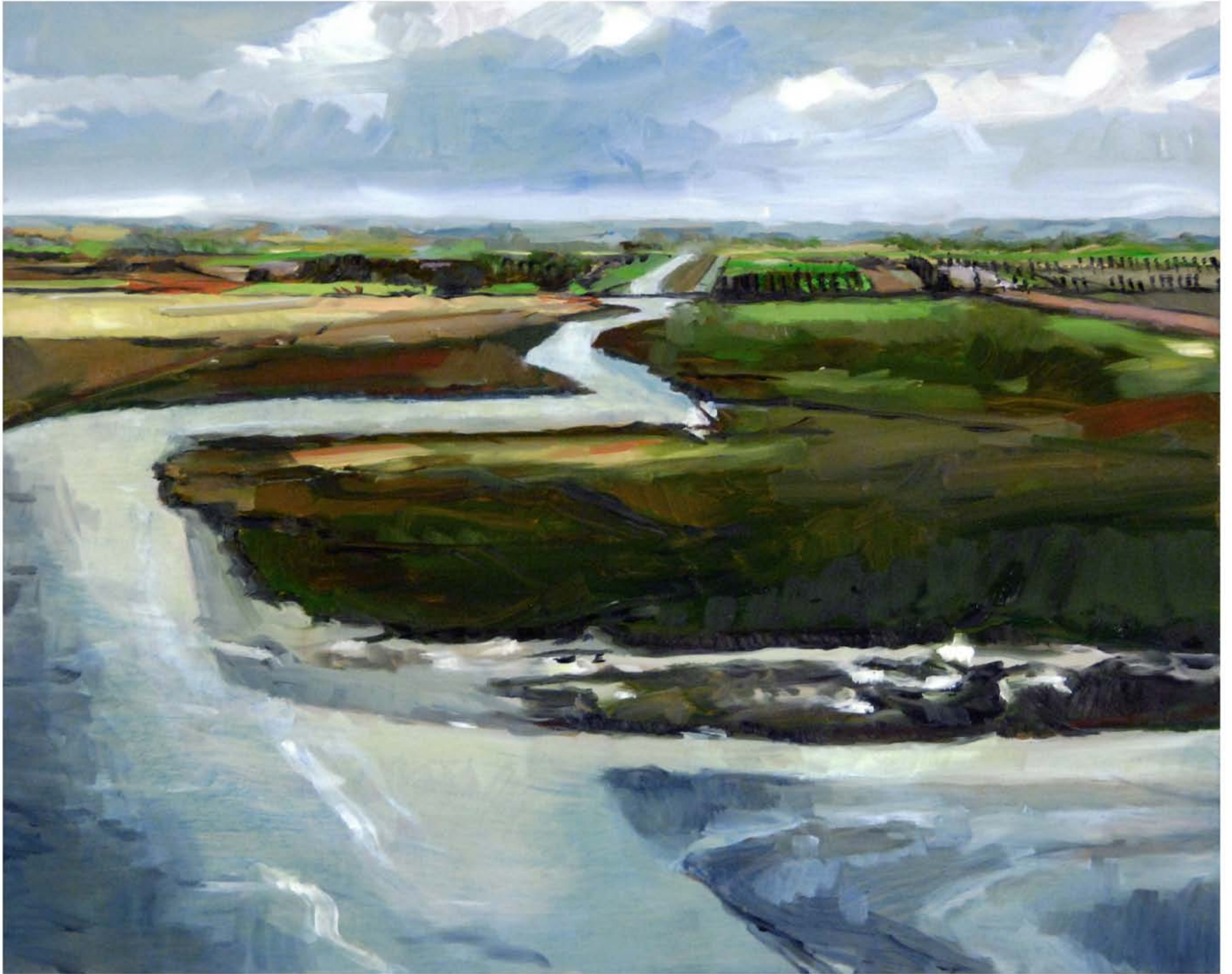
CANAL AND ESTUARY OIL 16" x 20"