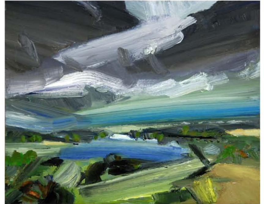
CLOCKWISE FROM TOP LEFT - LANDSCAPE WITH YELLOW FIELD OIL 12" x 15" HEATED LAND OIL 12" x 15" WINDSWEPT LANDSCAPE OIL 12" x 15" LANDSCAPE WITH HEDGE ROW OIL 12" x 15"