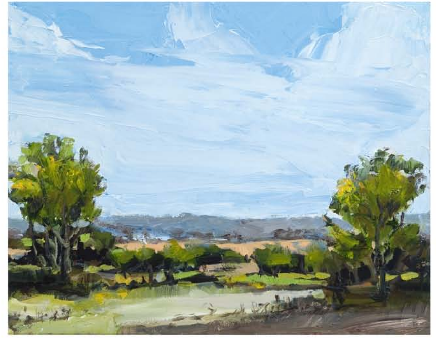
CLOCKWISE FROM TOP LEFT - LANDSCAPE WITH BROWN SKY OIL 12" x 15" NORMANDIE FIELD OIL 12" x 15" TWO TREES WITH WHEAT FIELD OIL 12" x 15" SMALL FIELD OIL 12" x 15"