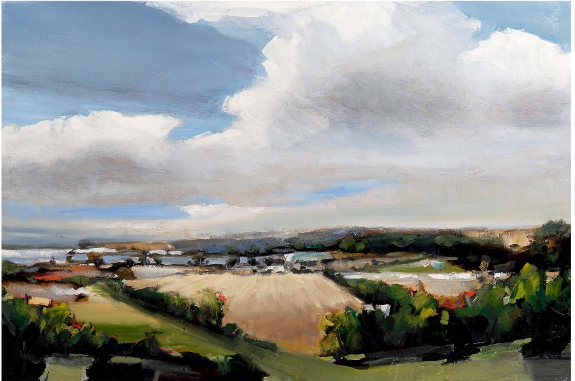
WHEAT FIELD OIL ON CANVAS 28" x 42"