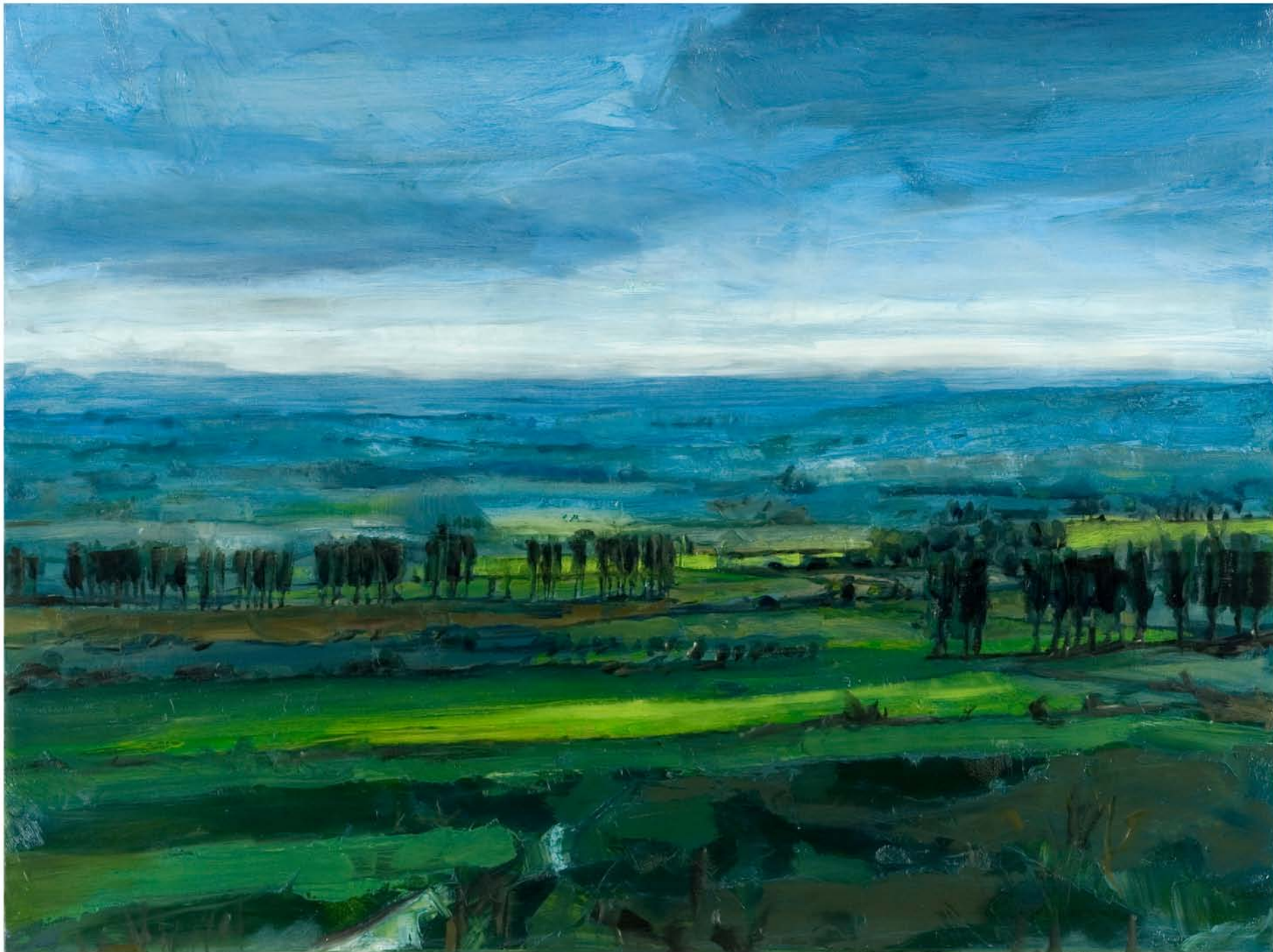
NORMANDIE NEAR MONT ST MICHAEL OIL ON CANVAS 36" x 48"