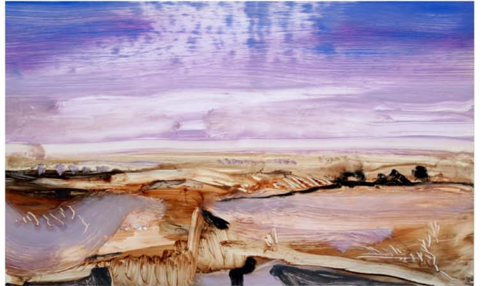
LANDSCAPE WITH MARSH OIL 10" x 17"