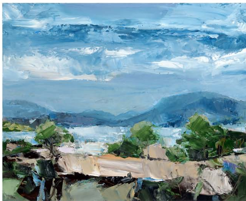
CLOCKWISE FROM TOP LEFT - LANDSCAPE WITH BUSHES IN FOREGROUND OIL 16" x 20" STORMY SUMMER LANDSCAPE - ONTARIO OIL 16" x 20" CHILLIWACK BEACH OIL 16" x 20" CORNISH LANDSCAPE WITH WHEAT OIL 16" x 20"