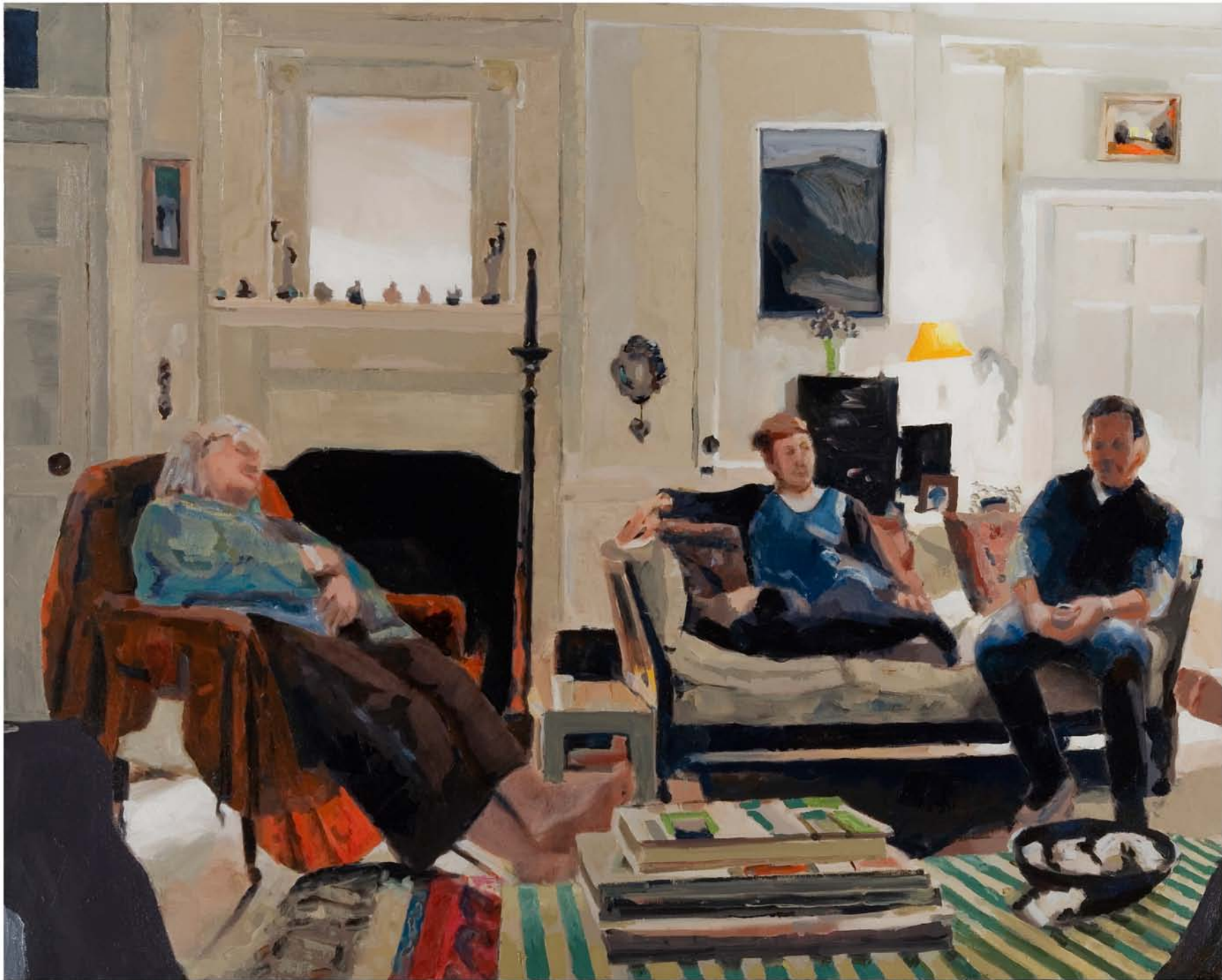
SITTING ROOM GATHERING OIL ON CANVAS 48" x 60"