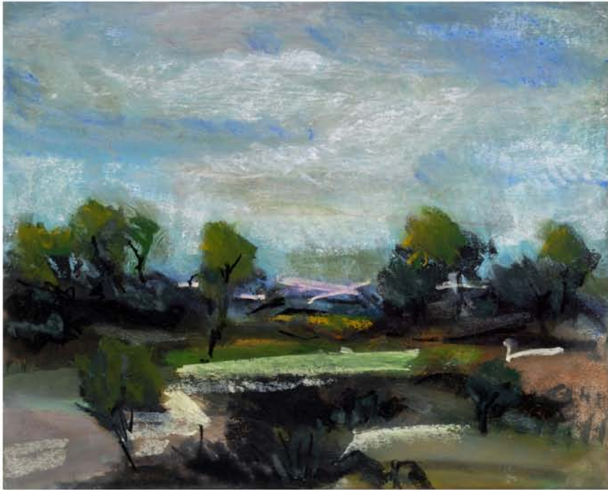
GROUPINGS OF TREES CHALK PASTEL OIL 12" x 15"