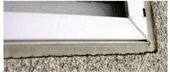
This is an adhesive caulk failure where the caulk remained adhered to the window but disengaged from the EFIS surround.

Leaking windows cause household damage. A leaking window presents many household complications. For example, unwanted water seeping into