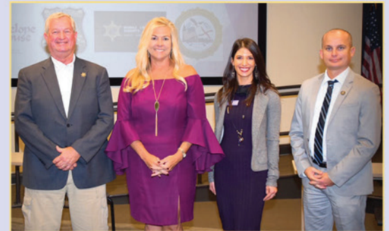
Mobile County DV Task Force - Lunch & Learn