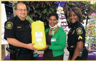
"Kiss A Cop" - Law Enforcement Appreciation - Mobile Court Police