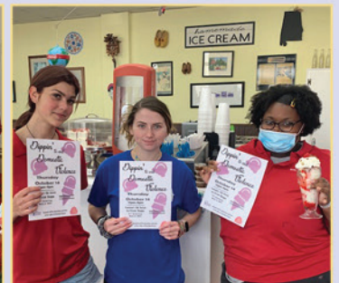
Cammie's Old Dutch Ice Cream Shoppe