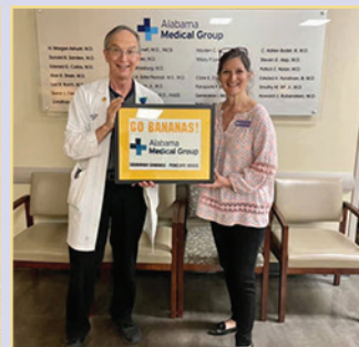
Savannah Bananas Alabama Medical Group