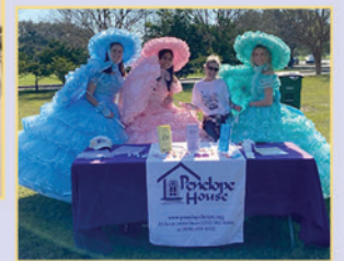
Domestic Violence Awareness