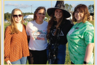
Kappa Delta Sorority Univ. of South Alabama