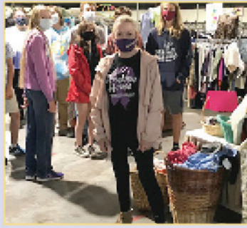
Covenant Christian School Volunteering at Penelope's Closet