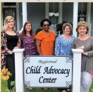
Regional Child Advocacy Center