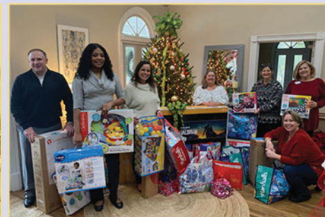
Better Homes and Gardens Real Estate Main Street Properties