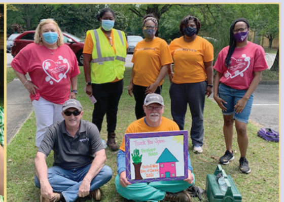
Spire - United Way Day of Caring