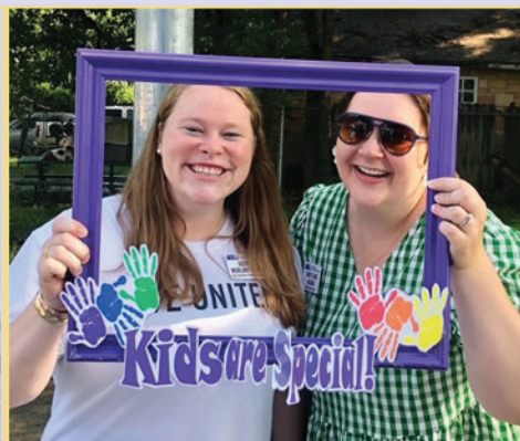
United Way of Southwest Alabama