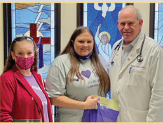
Health Cares About Domestic Violence Day - Victory Health

Penelope House thanks the entire community for their support!