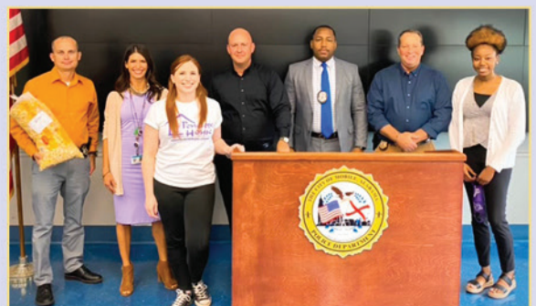
Mobile Police Department DV Unit