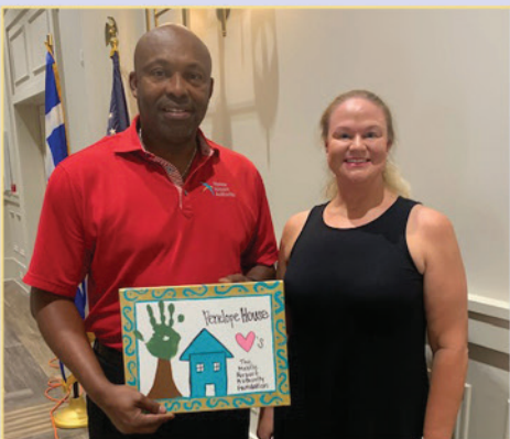
Mobile Airport Authority