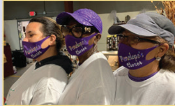
Penelope's Closet Staff