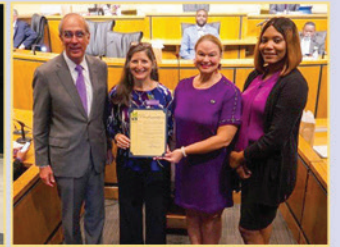
City of Mobile Proclamation