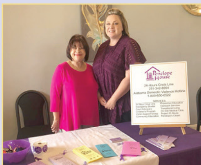
Domestic Violence Awareness, Washington County

PENELOPE'S CLOSET: Penelope's Closet is located at 2907 Old Shell Road, Mobile, Alabama. It continues to flourish due to the combination of location, loyal volunteers, donors, and the public. It is absolutely an essential component to our mission. Penelope's Closet provides our clients with clothing and other necessities at no cost. All proceeds from the Closet return to the shelter to further assist victims and their children.