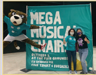
University of South Alabama Fund Raiser