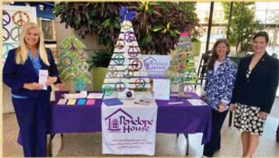
Mobile County DA's Office Domestic Violence Awareness Month