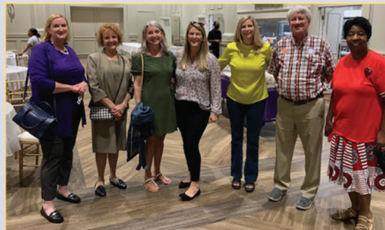
Board Members attending reception