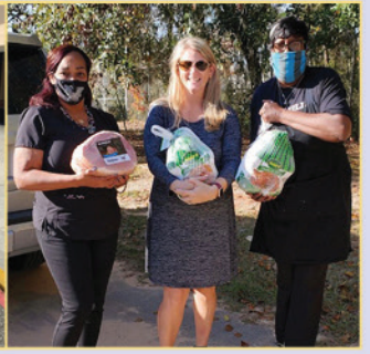
Alabama Power Service Organization