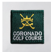
cotton twill appliqué