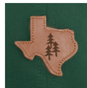
leather printed patch (one color ink)