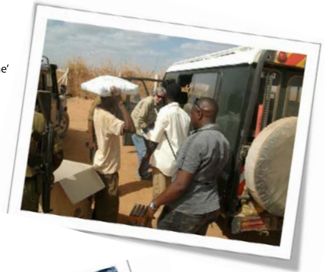
'Leadership from the frontline'

Running with Turtles focuses on the stories of men and women from the Bible who had to prove themselves in the line of fire and face conflict. We can all learn from these people and push ourselves to do the same. A turtle on a fencepost didn't get there by himself – someone had to help him. This book is meant to help those who, like the biblical characters, are meant to stand out amongst others.