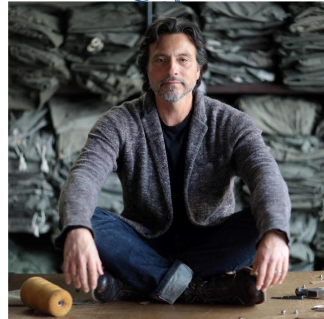
ERWIN RAPHAEL MCMANUS