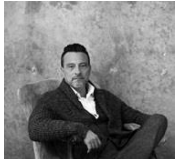
Erwin Raphael McManus

Totally reader friendly without losing any integrity and with its easy conversational authorship, The Artisan Soul enables all ages to access this knowledge and become better human beings the way that God intended. It also has contained a series of questions that you can ask yourself to enable you to explore further your artistic side. Widely available on Amazon it is a must read and one that you could read again and again many years from now and be reminded that you are in essence a creative human being.