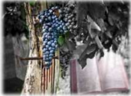
3-in-1 The Voice is delighted to introduce you to Sylvia Reeve.