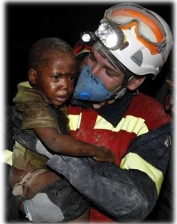
'Passing by? Not an option': A child is rescued by an emergency worker from the rubble in Haiti. The earthquake hit the country in January 2010.

As for Haiti that is a disaster where passing by on the other side of the street is just not an option . Regardless of political or religious beliefs, our humanity demands that we do our utmost to help. Already, organisations like the Red Cross have swung into action bringing the glue of compassion to help piece together the fragmented pieces of shattered lives. Celebrities, politicians, businessmen, and many from other walks of life are heeding the cries of despair and contributing from their individual storehouses.