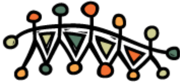
The African Children's Choir