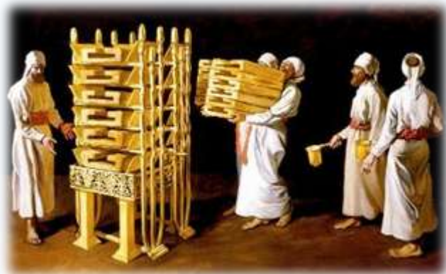
Arranging the showbread

Within the Torah, the Shewbread is mentioned exclusively by the Priestly Code and Holiness Code but certain sections of the Bible, including the Book of Chronicles, Books of Samuel, and Book of Kings, also describe aspects of them. In the Holiness Code, the Shewbread is described as twelve cakes/loaves baked from fine flour, arranged in two rows/piles on a table standing before God ; each loaf/cake was to contain two Omers of flour (Leviticus 24:5-6). The Biblical regulations specify that cups of frankincense were to be placed upon the rows of cakes, and the Septuagint, but not the masoretic text, states that salt was mixed with the frankincense; the frankincense, which the Septuagint refers to as an anamnesis , a hapax legomenon), constituted a memorial ( azkarah ), having been offered upon the altar to God (Leviticus 24:7-9)