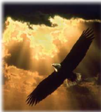
...and how I bore you on eagles' wings and brought you to Myself.' Ex 19:4

I am in my seventh year now of this disease, and for the last two years, my condition has been stable. I have holidayed in France several times, spent three weeks in the Caribbean last winter, and recently a week cruising in Norway. Something I could never have done without my little black box. I looked on it as my lifeline, until, during a Bible study, we were asked to write a short piece of prose, on the most important thing in our life.