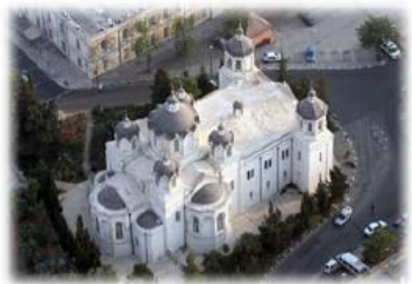
The Holy Trinity Cathedral, Jerusalem

During the mid-19th century, the Russian Orthodox Church began to expand its influence in the Holy Land. This encouraged waves of pilgrims to make the journey to the holy places.