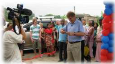
Opening of the Children's Home in Kolkata in October 2009!

Despite numerous rehearsals beforehand, there was still some nervousness as we arrived at the schools for the assemblies each day, but we asked God for strength and courage. Any nervousness drifted away as we were greeted by excited children, who were eager for attention. Their excitement was infectious and we were soon able to relax and enjoy ourselves thanks to God. Through the assemblies we wanted to teach about God's love and faithfulness not only through the saving of Noah but also how Jesus gave His life for our sins.