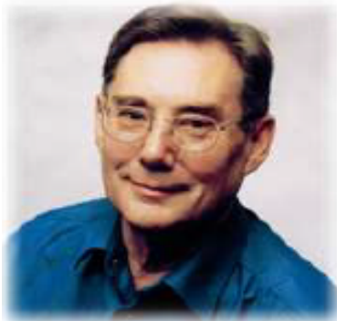
Ray Barnett Founder African Children's Choir

However, imagine a scenario where parental death, not only incurs emotional trauma but actually decrees the forfeit of a youngster's life. It may, to contemporary society, appear incredulous that a child, caught in the throes of grief, should also have to suffer the pangs of hunger and total abandonment.