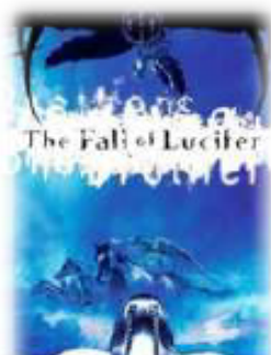
Book 1 - The Chronicles of Brothers Series

I had a general outline for SON OF PERDITION and the first 100 pages written by March 2009 – but the majority of the book (the other 300 odd pages!) was written over a gruelling summer in Kansas in the Midwest over a period of THREE MONTHS. My study was literally filled with research books, web research and my dog and cat.