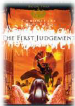
Book 2 - Messiah

Q How was writing this book different from the first two or was there a difference?