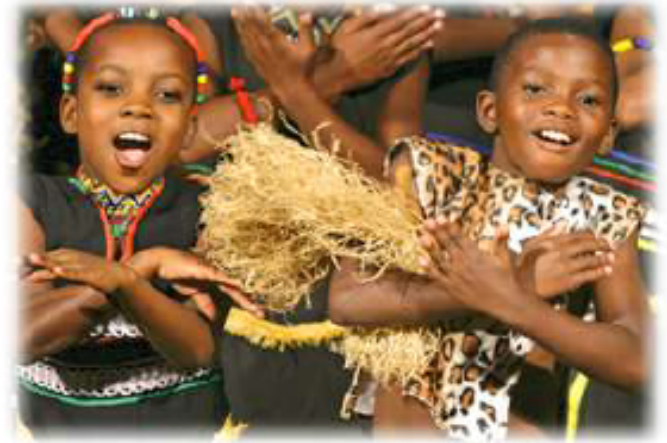
The world renowned African Children's Choir, raising awareness and essential funds...