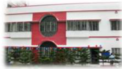
The Children's Home is a refuge for local children...