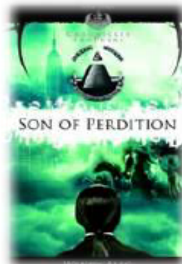
Book 3 – Released in UK 01 Dec 2009

the Angelic and the vast landscape of the Book of Revelation.