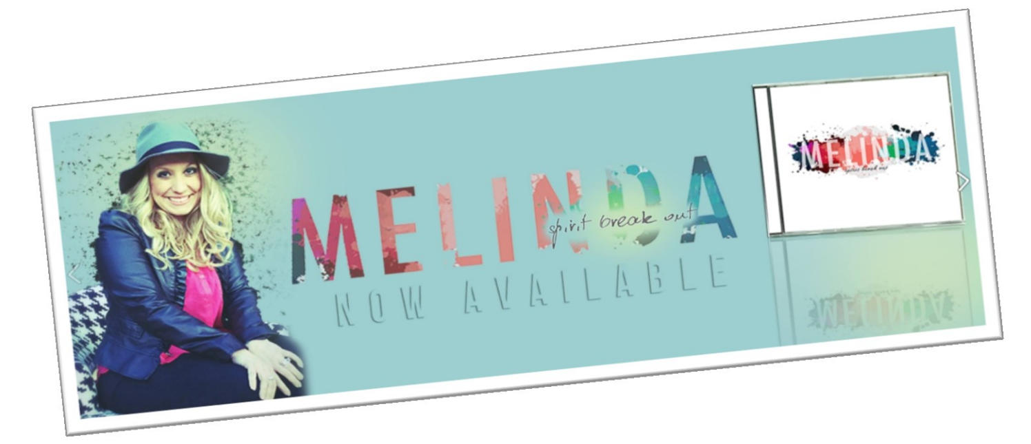
the Lords message to His creation that we can do all things through Him when we believe!