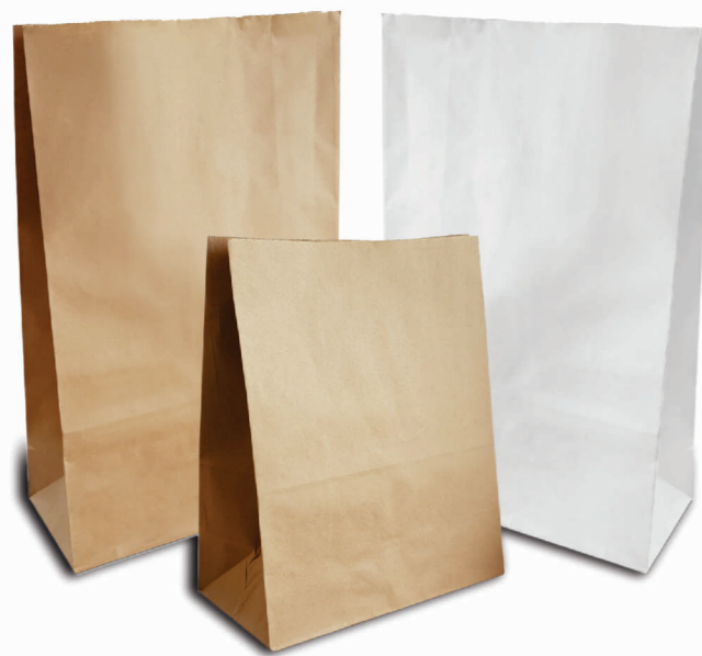
Square Bottom Paper Pouches