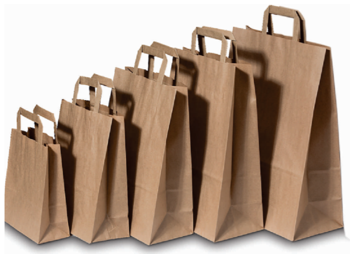
Flat Handle Paper Bags