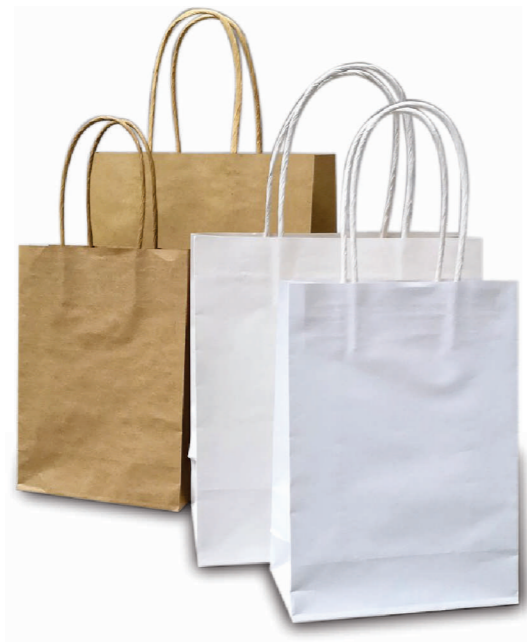
Twisted Handle Kraft/White Paper Bags