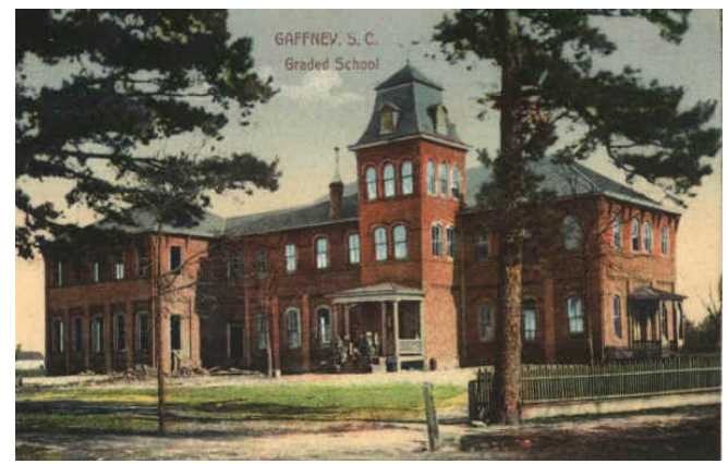
Original Central School Building, c. 1900