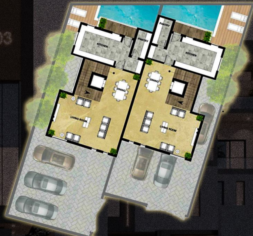
FIRST FLOOR PLAN GFA: 117 SQM