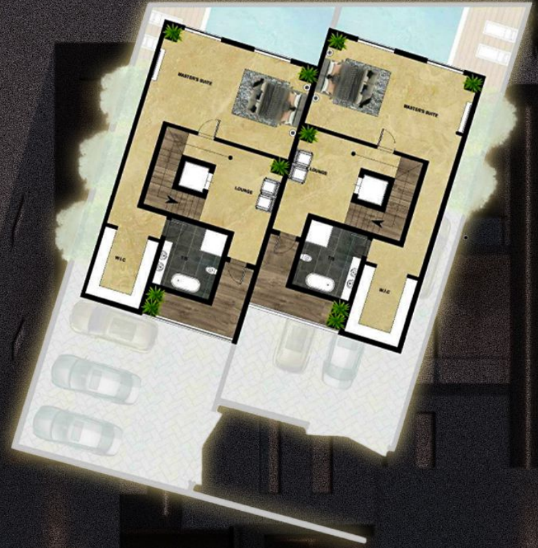
THIRD FLOOR PLAN GFA: 117 SQM