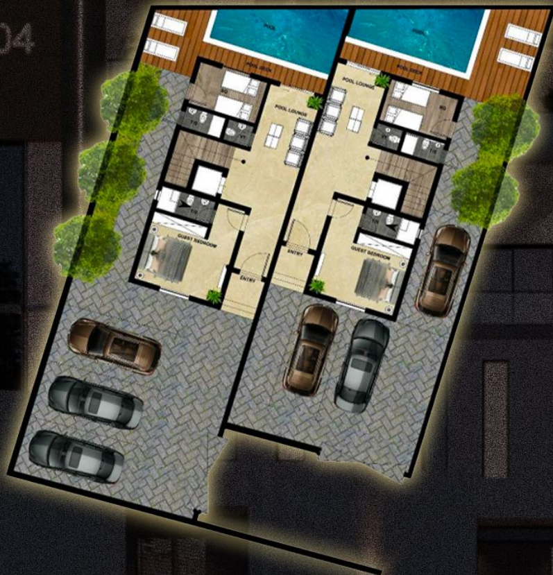
GROUND FLOOR PLAN GFA: 83.1 SQM