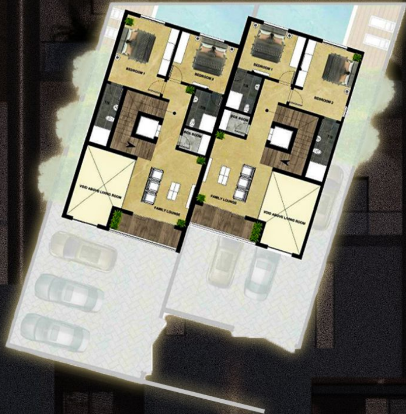
SECOND FLOOR PLAN GFA: 117 SQM