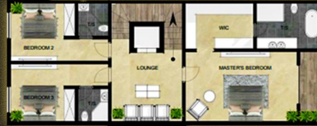
SECOND FLOOR FSA: 107 SQM