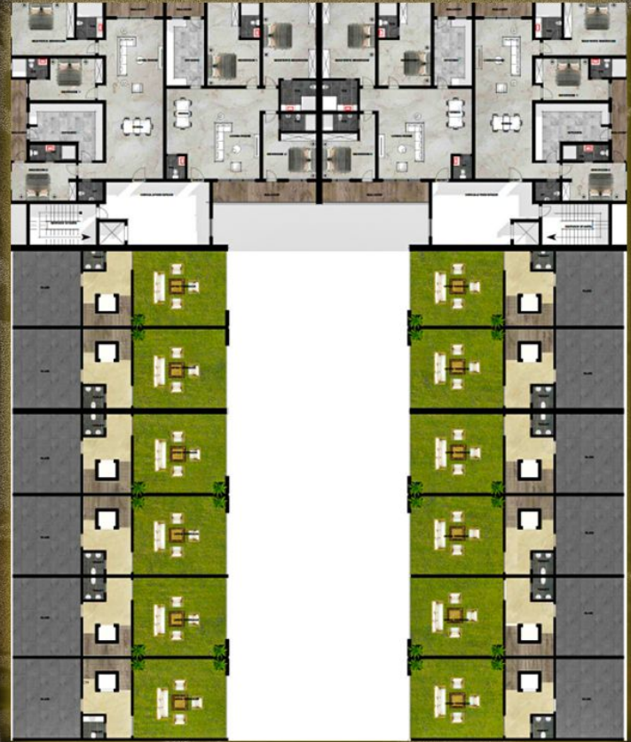
FLOOR SQUARE AREA: 2194.15 SQM PENT FLOOR PLAN