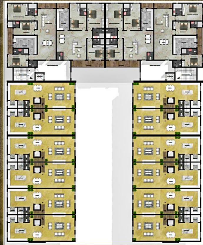
FLOOR SQUARE AREA 2194.15 SQM FIRST FLOOR PLAN