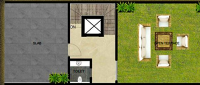
PENT FLOOR FSA: 107 SQM