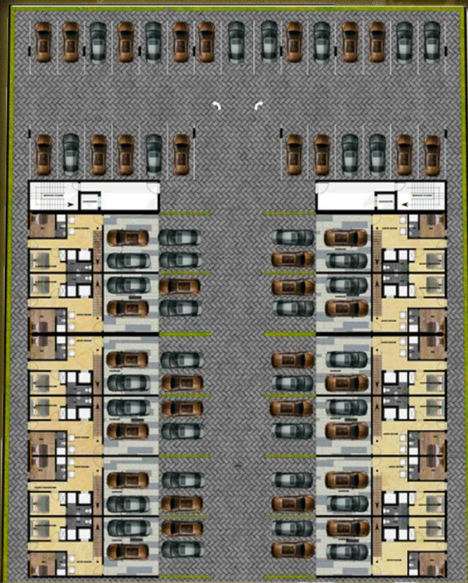
FLOOR SQUARE AREA: 1218.14 SQM GROUND FLOOR PLAN