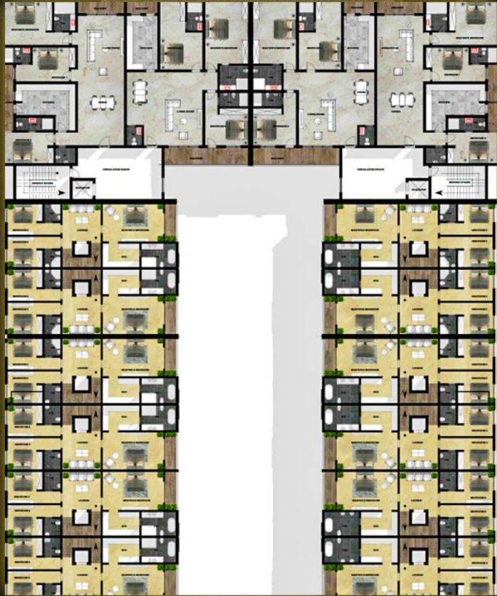
FLOOR SQUARE AREA: 2194.15 SQM SECOND FLOOR PLAN