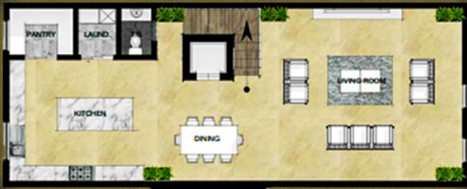
FIRST FLOOR FSA: 107 SQM