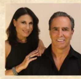
Apr. 12, 2024 Manhattan Connection